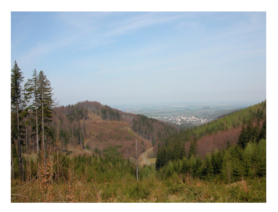
Zámecký hill with Edelštejn Castle from the south.