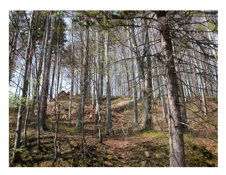
Bastion of the south court of the upper ward, view from the north-east.