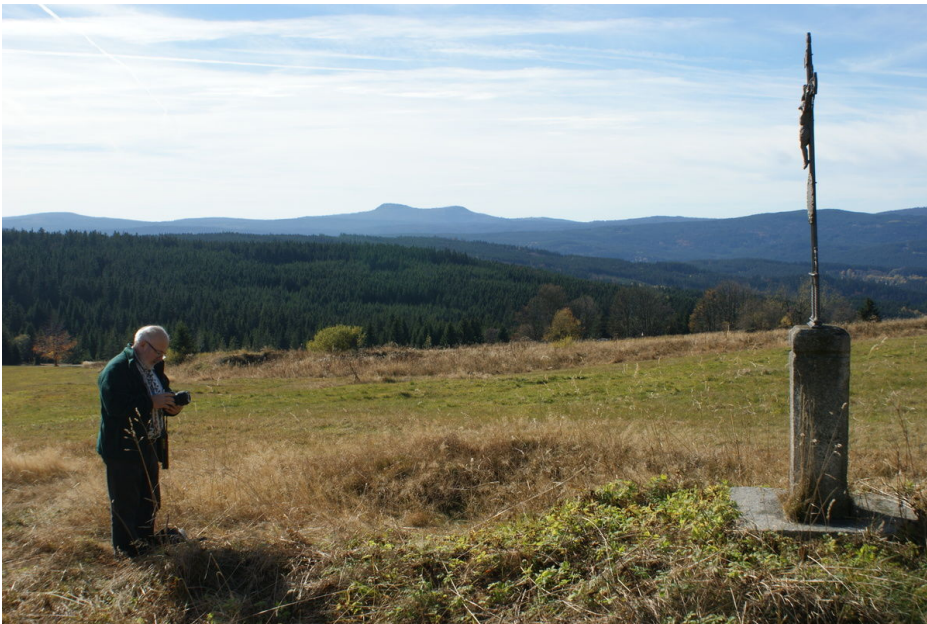
One of the three preserved crosses.