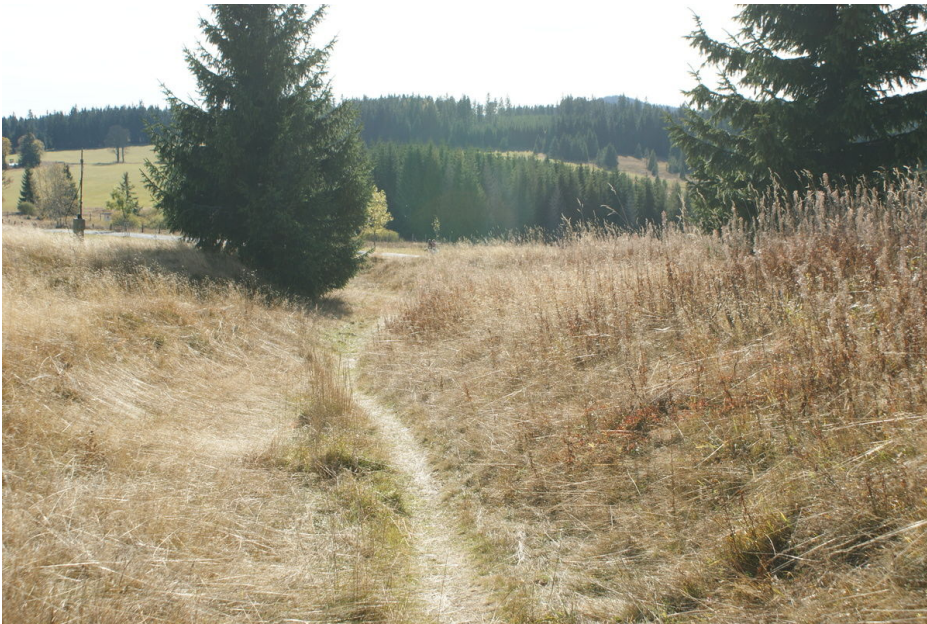
Preserved part of the Golden Trail.