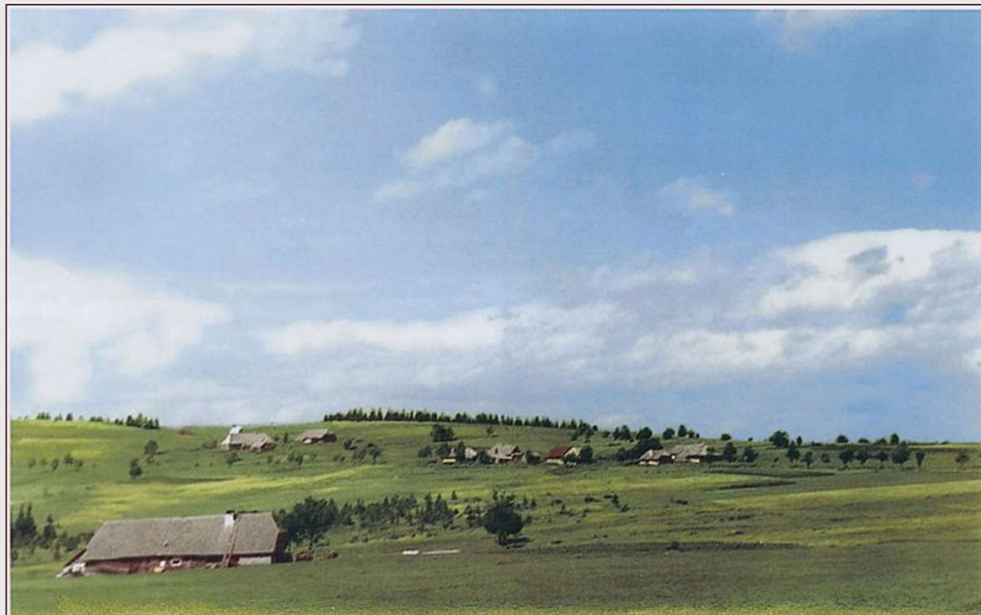
Zhůří on a postcard from the first half of 20th century.