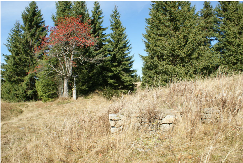
Corner of a deserted house, one of the three crosses in the background.