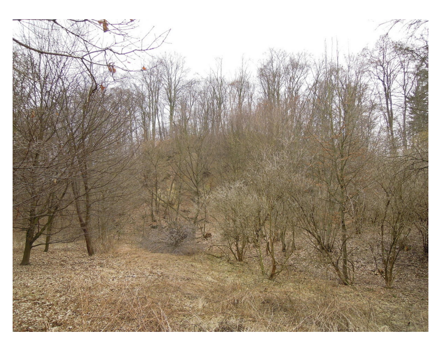
View of the site from the south. Photo J. Dúbravčík, 2015.