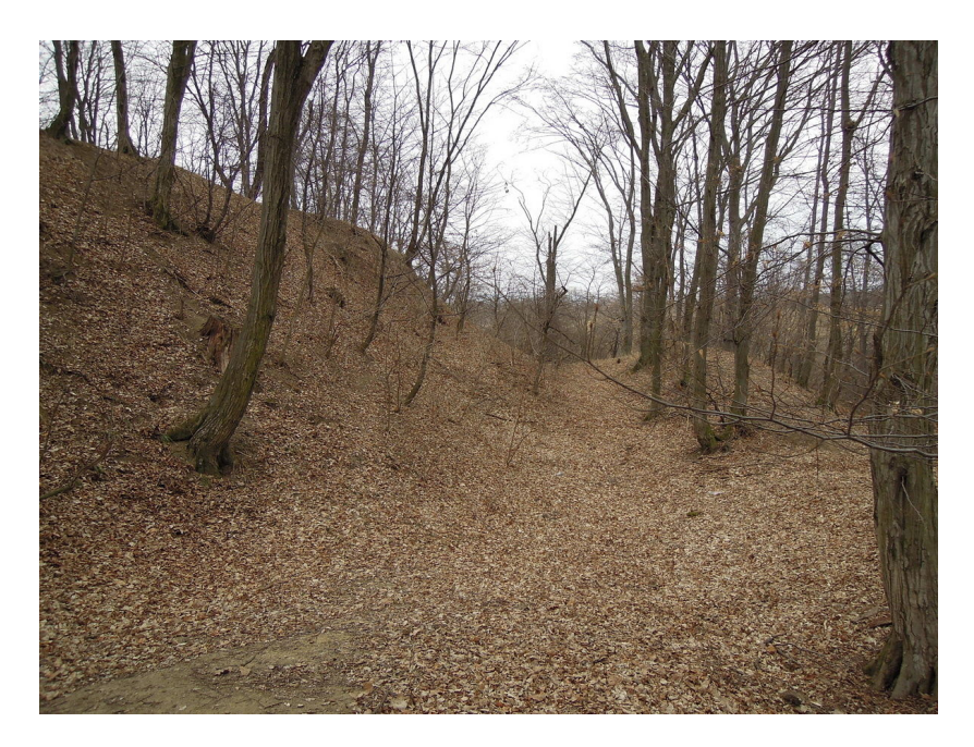
Settled hill of the small castle with ditch and outer rampart.