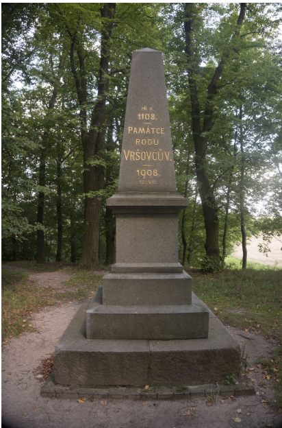
Memorial in the memory of slaughtering of the Vršovci noble family in 1108, built in 1908.