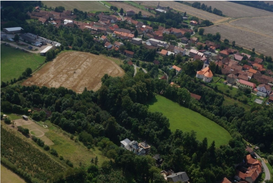
Aerial view of the hillfort.