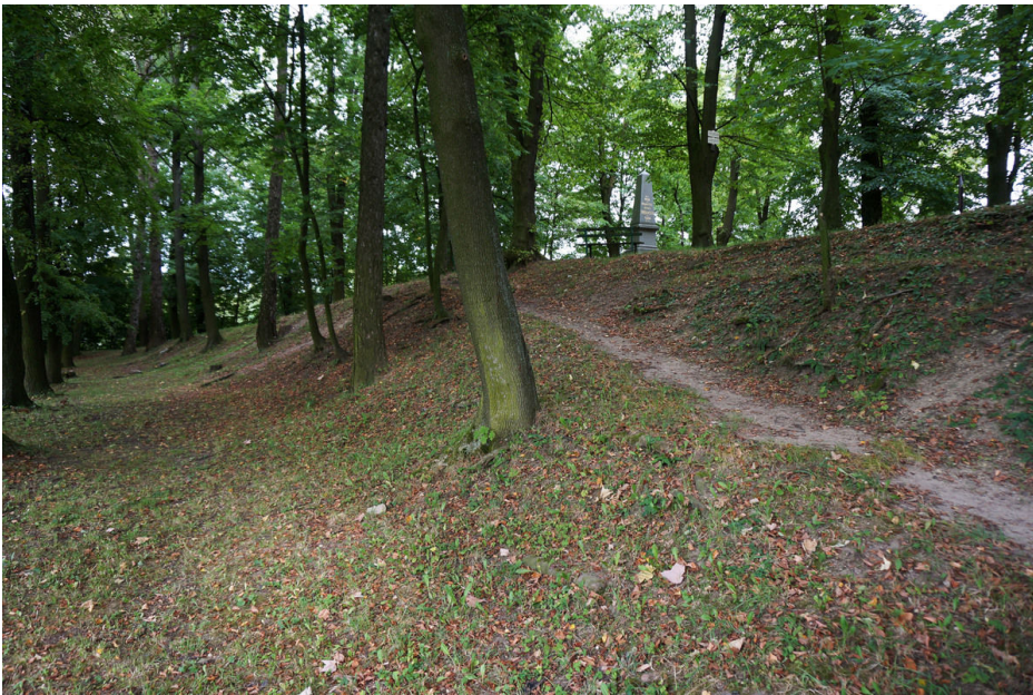
Hillfort's fortification, taken from southwest.