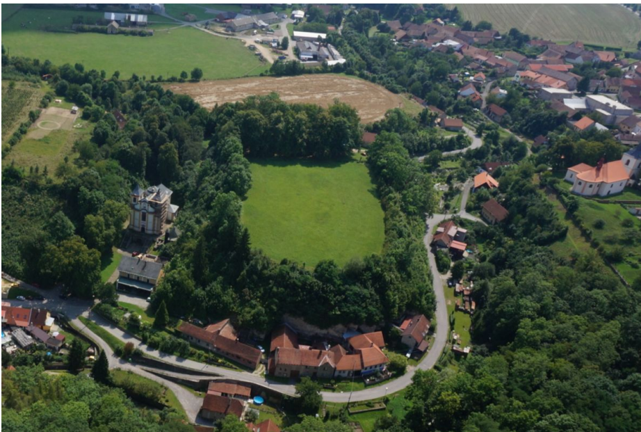
Aerial view of the hillfort.