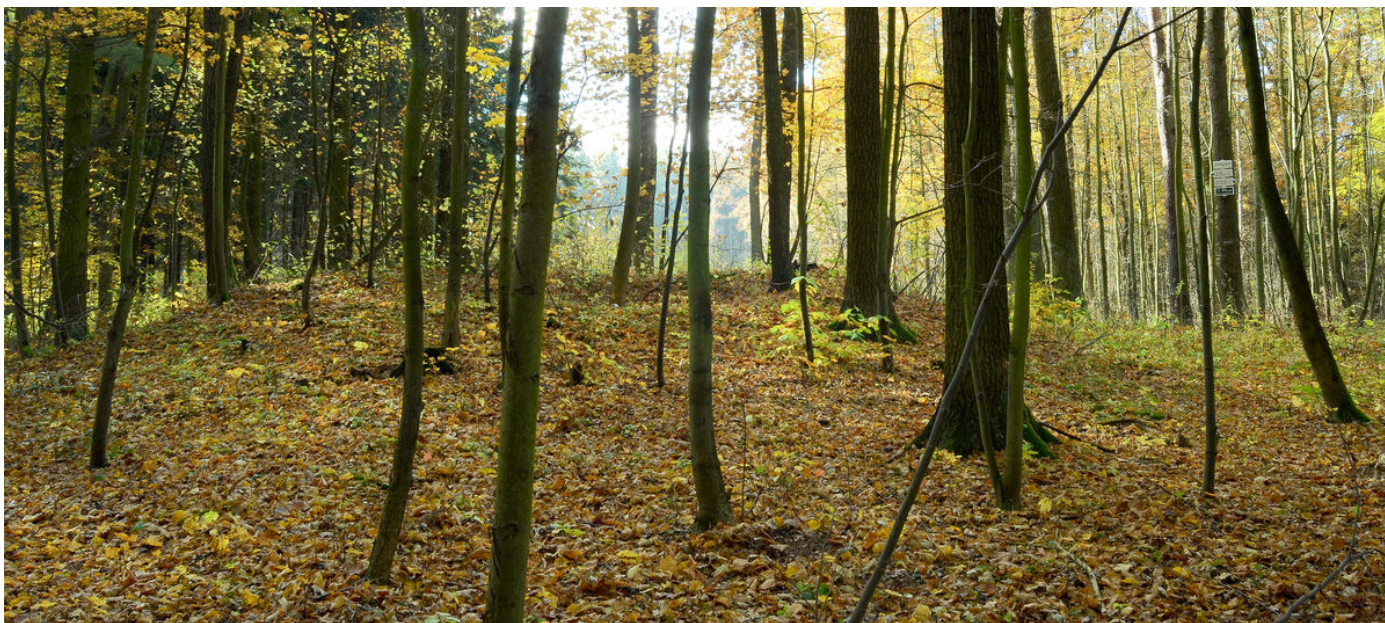
One of barrows on the cemetery.