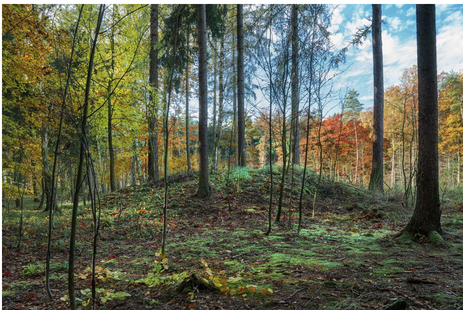
One of barrows on the cemetery.