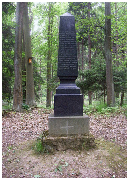
1953 memorial of the archaeological excavations in 1891–1892.