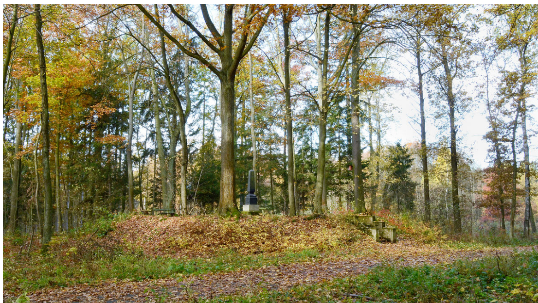
Barrow Nr. 23.