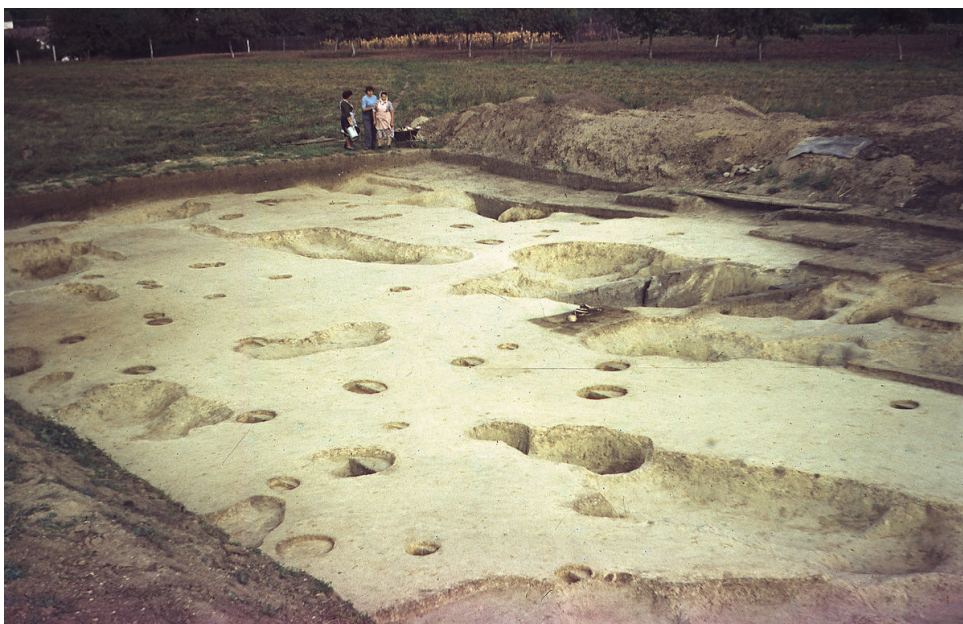
Excavation in 1965, view from the west.