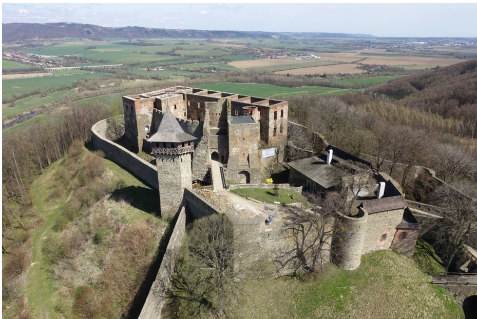
Aerial photo of the castle core with the Kravaře Bailey from the south.