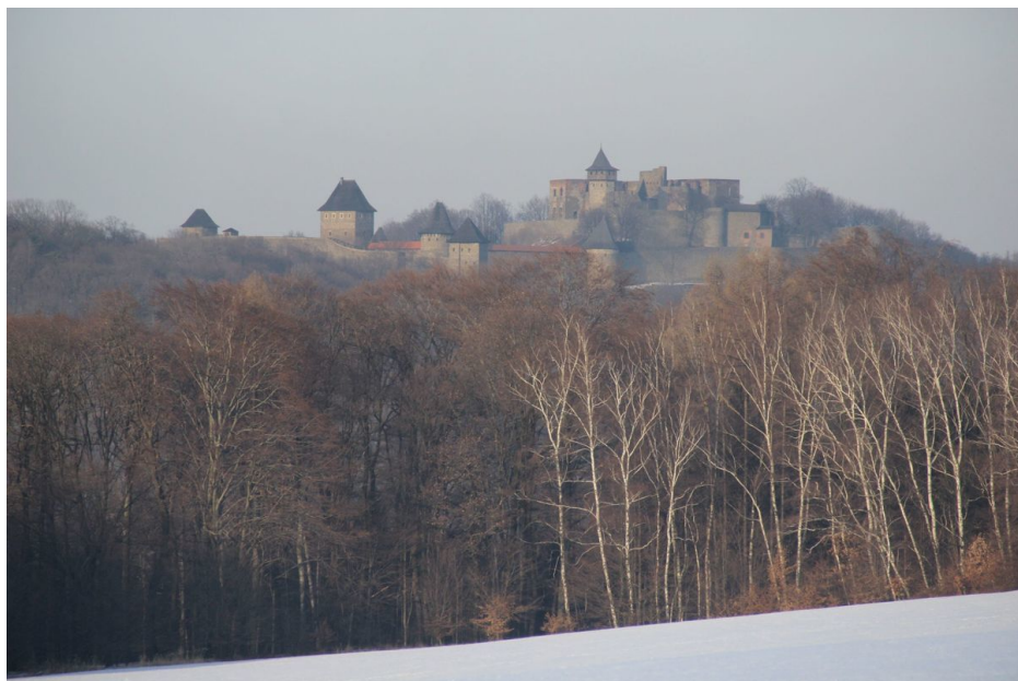
View of the fortified area of Helfštýn Castle in the winter; from Lhota in the south-west. Photo Z. Schenk, 2017.