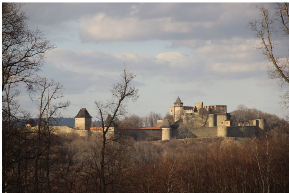
View of the high wooded knoll at Helfštýn Castle in the autumn; from Lhota in the south-west.