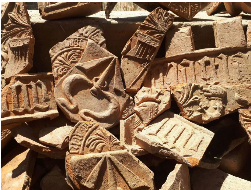
Collection of fragments of late Gothic stove tiles decorated with the coat of arms of the Lords of Kravaře and the Kostkas of Postupice, which were found in the debris under one of the residential rooms.