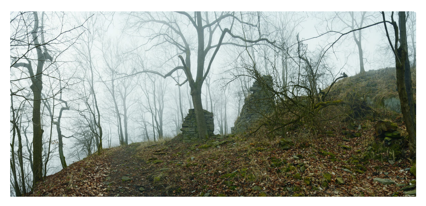
Fifth gateway - the entrance to the castle. Photo Z. Kačerová, 2014.