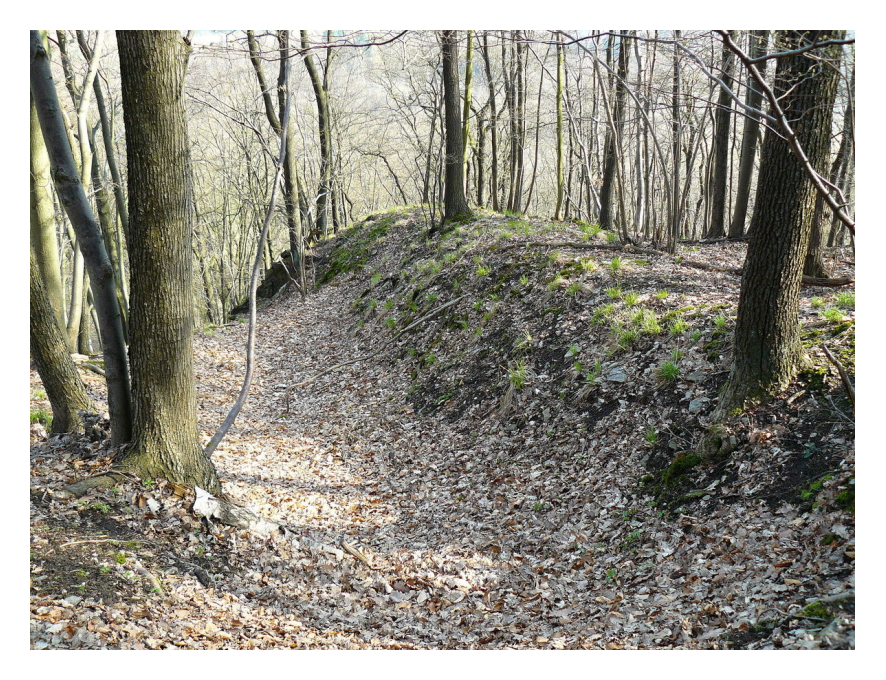
Bank fortification in the northern foreground of the castle.