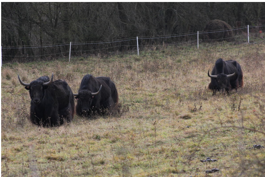
Dnešní páni hradiště – jaci.