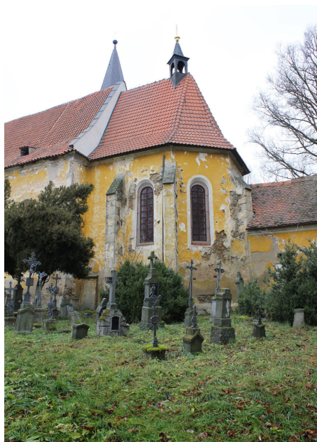
Gothic end of the St. Laurentius church.