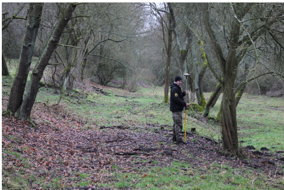
Documentation of surface markers by a GPS receiver.