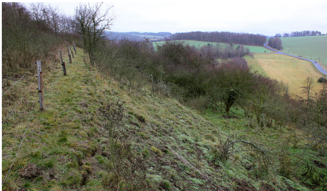
Deserted vineyard on southwestern spole of the hill.