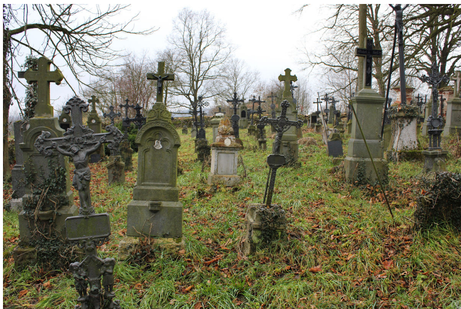
Cemetery at Tasnovice.