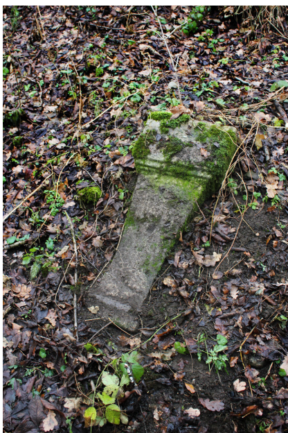
Present-day state of preservation of one of Stations of the Cross.