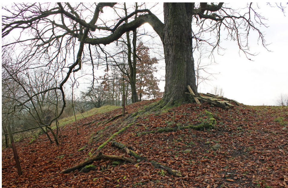
Inner bank. Surface relicts are well visible in the time of vegetative dormancy.