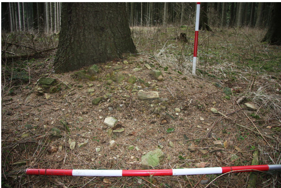
Extracted rocks – spoil.