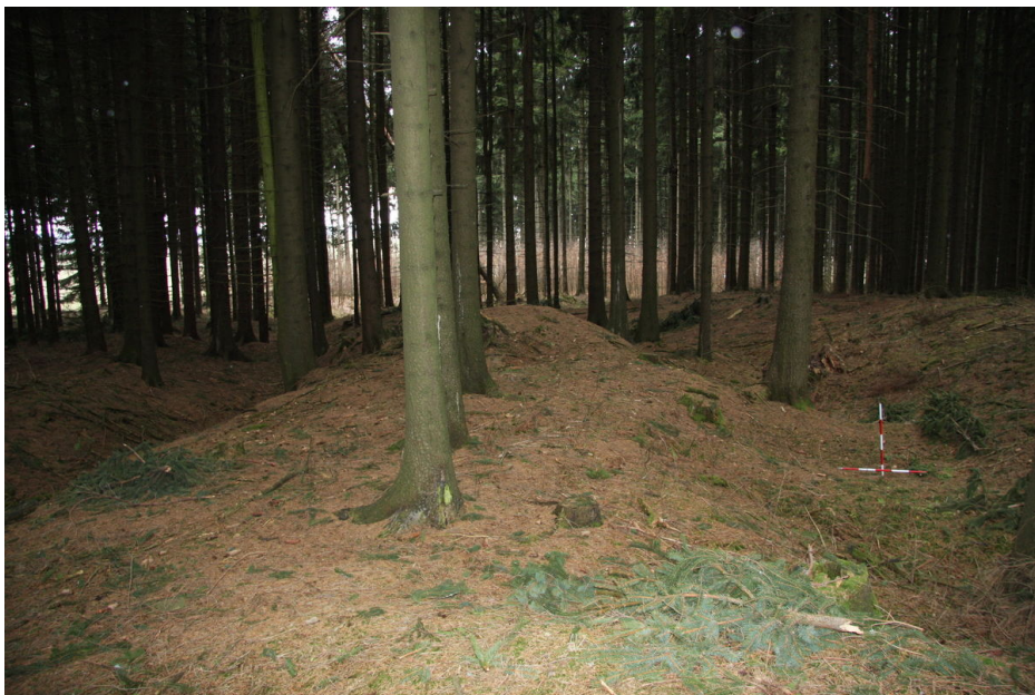
A pair of oval pings.