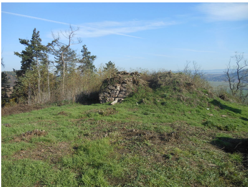
View of the chapel walls from the west.