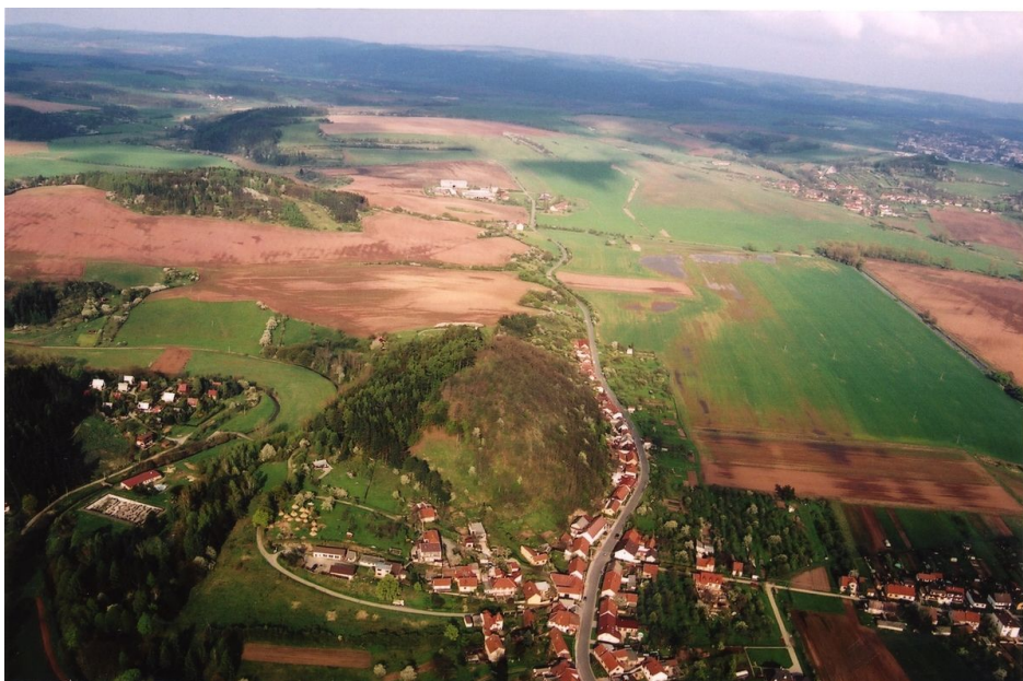
Aerial view of the hillfort from the west.