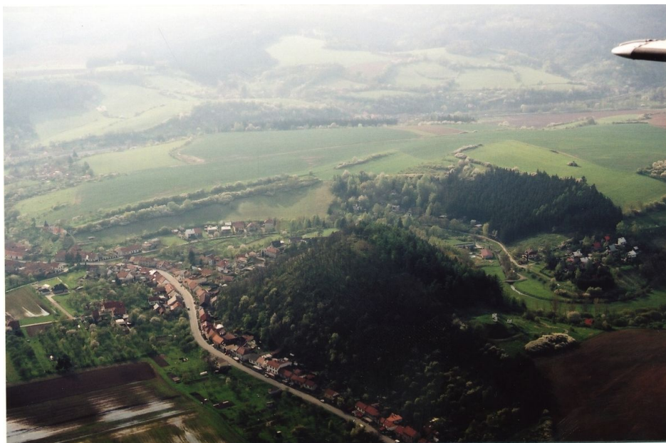
Aerial view of the hillfort from the south.