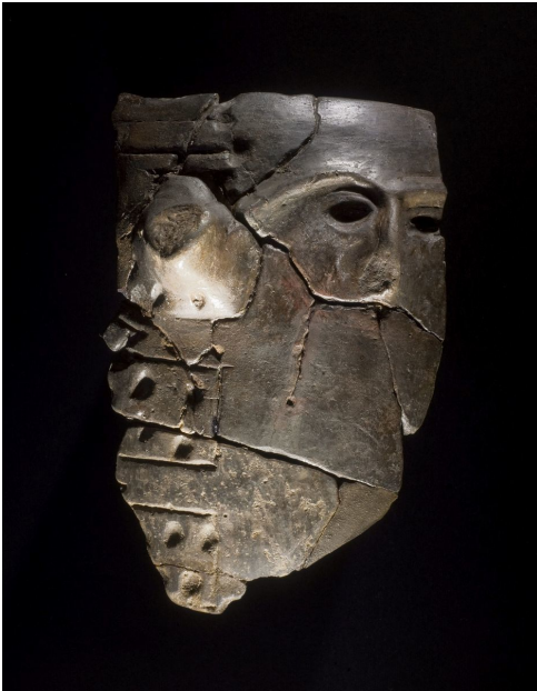
Fragment of a prehistoric ceramic vessel with a human figure (Neolithic; Linear Pottery culture) from Koňská jáma Cave.