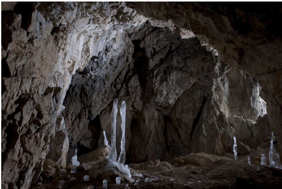
Koňská jáma Cave; the chambers are immediately behind the entrance portal.