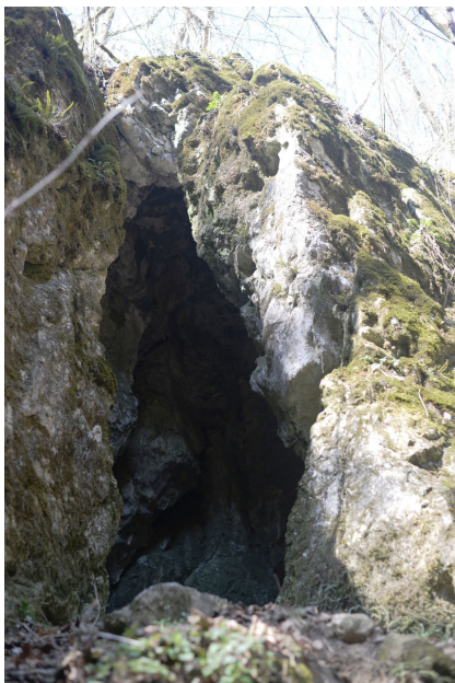
Koňská jáma Cave, main entrance.