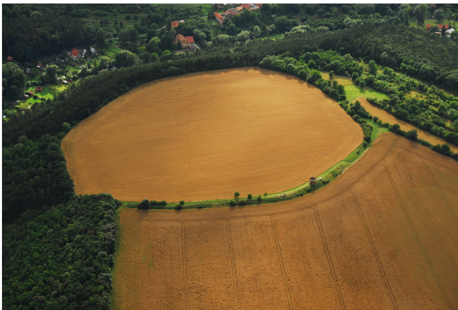
Aerial view of the hillfort.