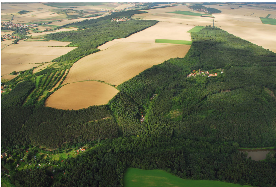
Aerial view of the hillfort.