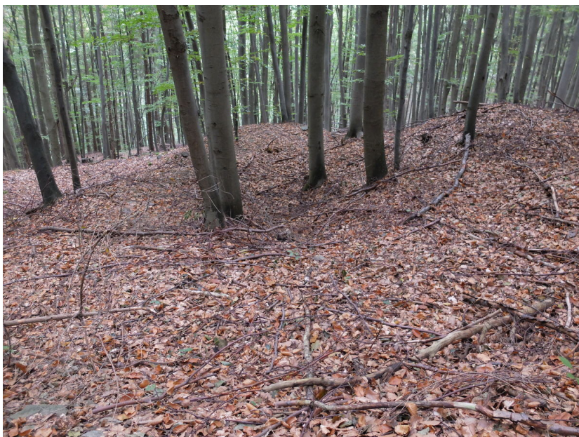
Traces of mining in the forest.