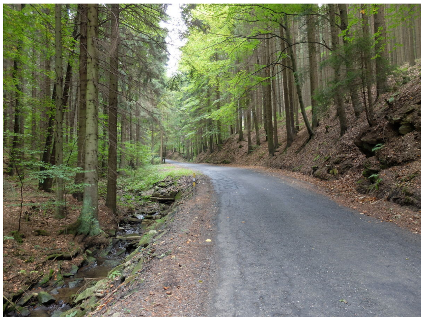
View of the site and its setting in the landscape.