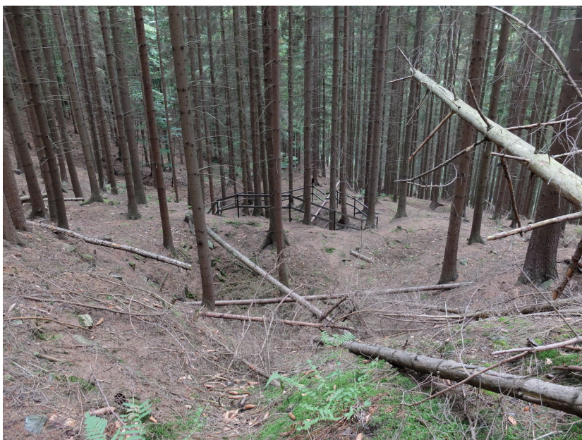
View of a mining pit.