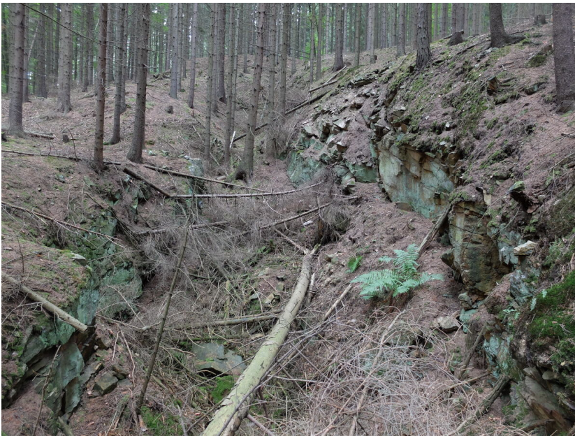
Low walls of quarried stone.