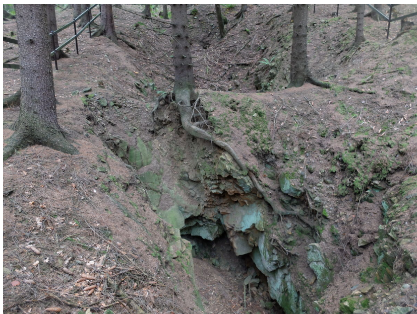
Low walls of quarried stone.