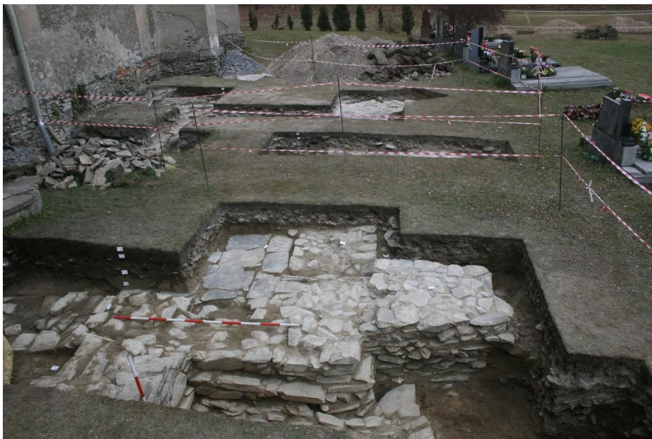
Church of the Immaculate Conception of the Virgin Mary, uncovered walls by the south wall of the presbytery during the excavation.