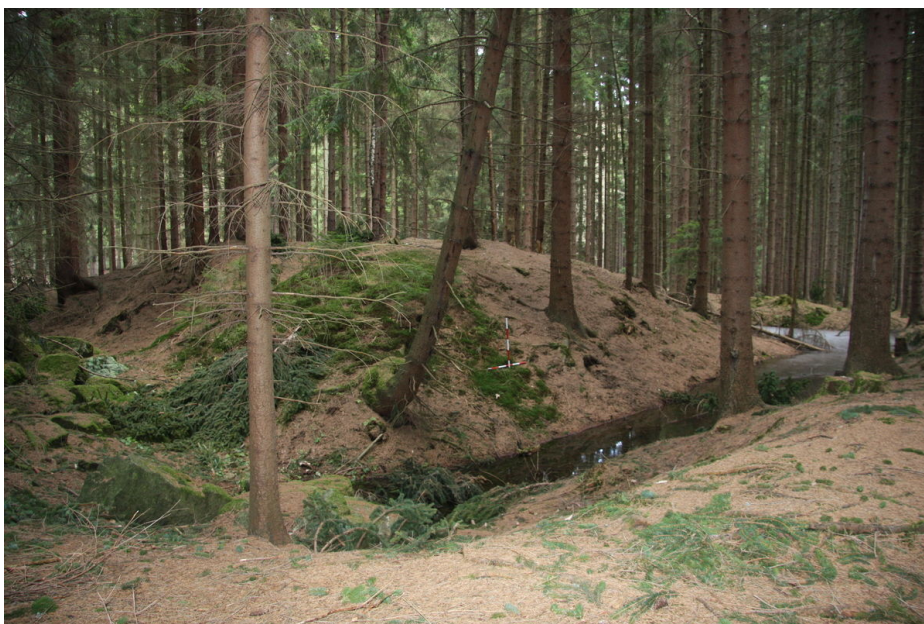
Ruins of a fortress with preserved rampart and motte.