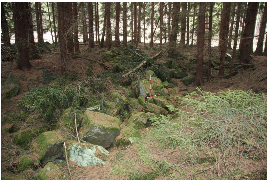
In the northern part, the moat is filled with stones that may stem from the original residential building.