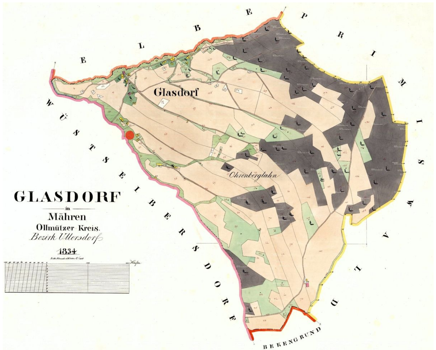
Abandoned glass works on a map from 1834.