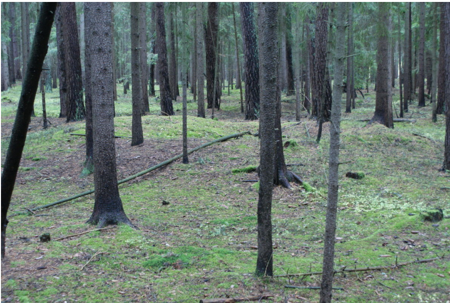
A barrow on the cemetery.