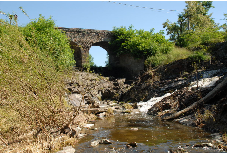
Natural monument "Smutný" below the barrow cemetery.