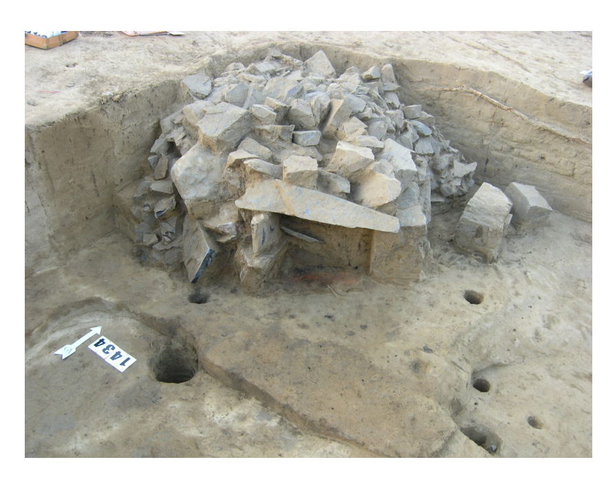
Stone oven in an Early Medieval house.