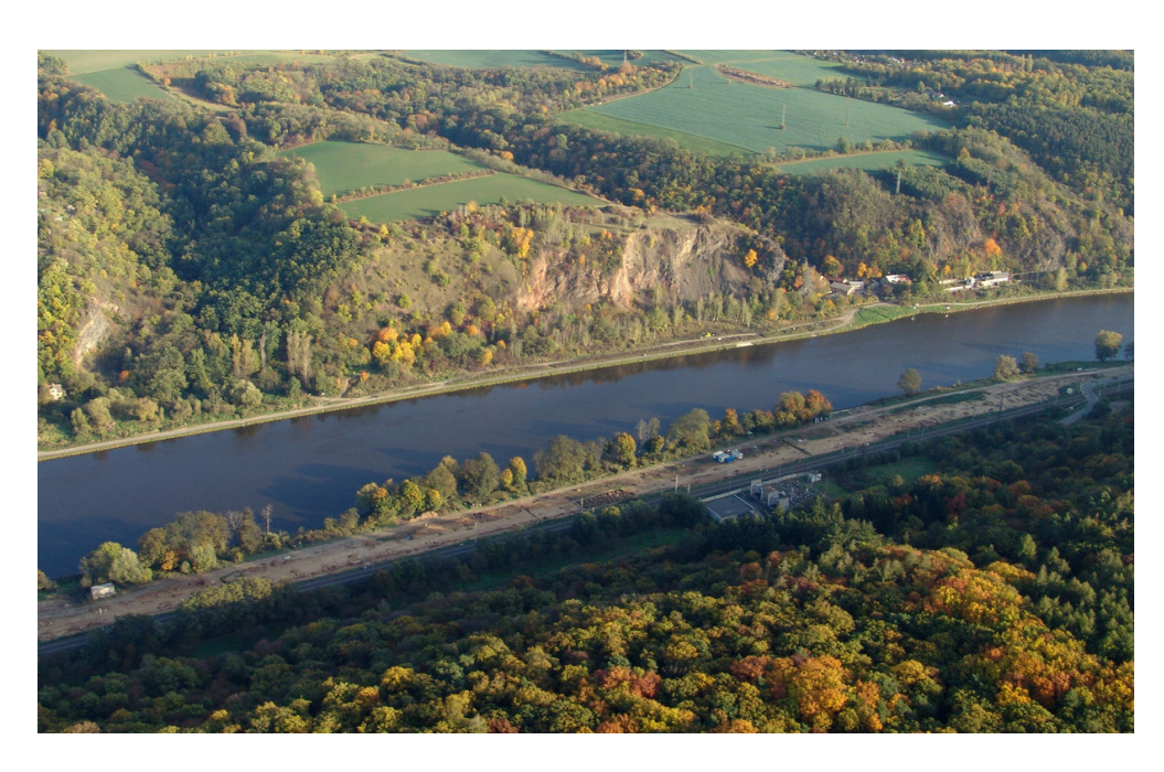
Site during archaeological excavations. Hillfort 'Zámka' in Prague-Bohnice in on the opposite bank of the river. Photo M. Gojda, 2006.