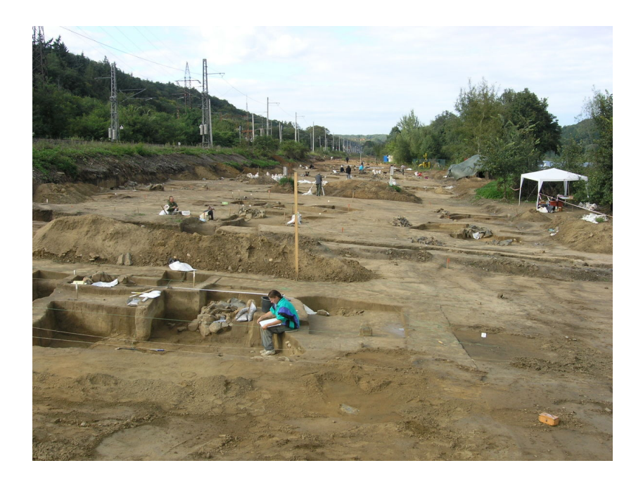
Archaeological field works on the road relocation.