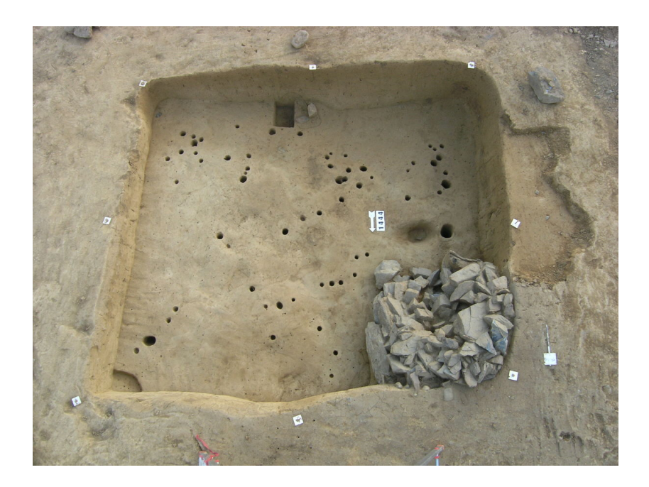
Early Medieval house after the excavations.