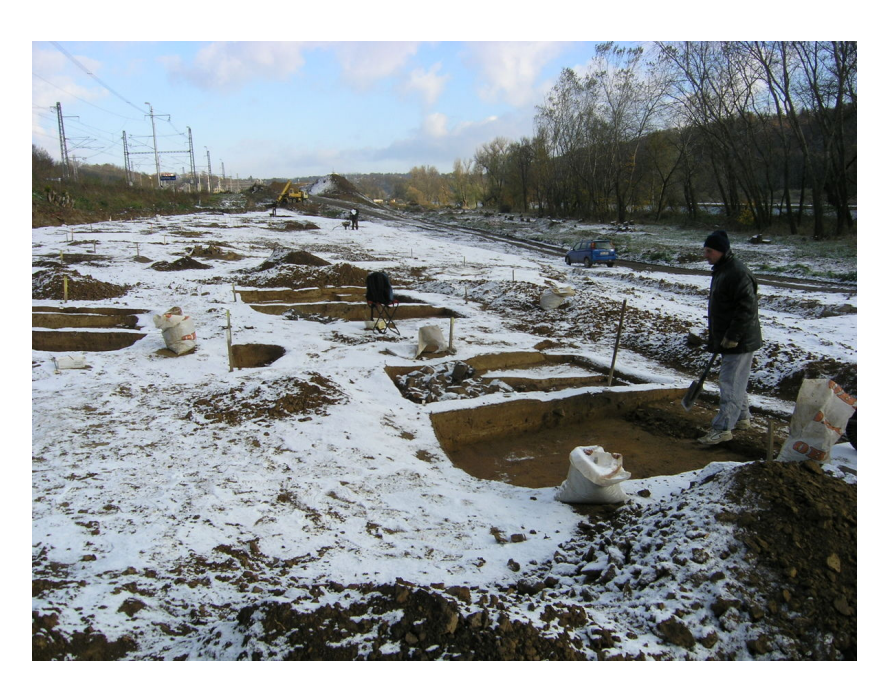
\label{lem:condition} \mbox{Archaeological field works on the road \ relocation.}