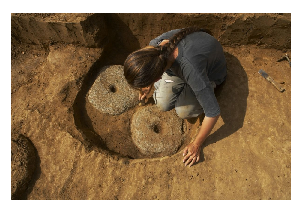
Early Medieval pit with two millstones - quernstones.