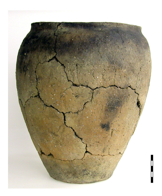
A vessel of the Culture with the Prague-pottery type.