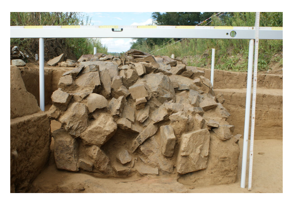
Stone oven in an Early Medieval house during field documentation.