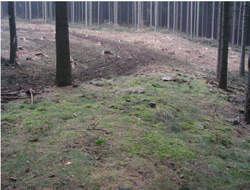
Bank disturbed by gathering of the wood.