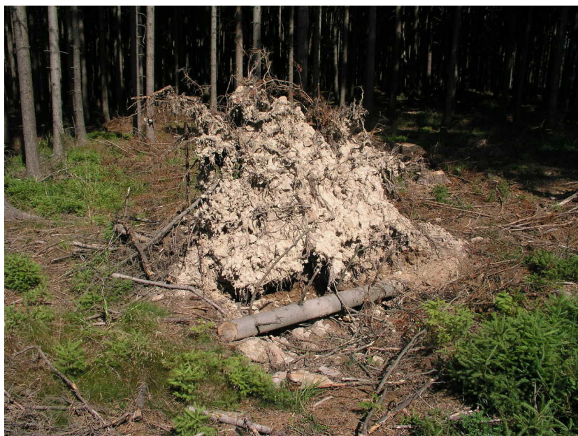
One of windthrows with pottery sherds.