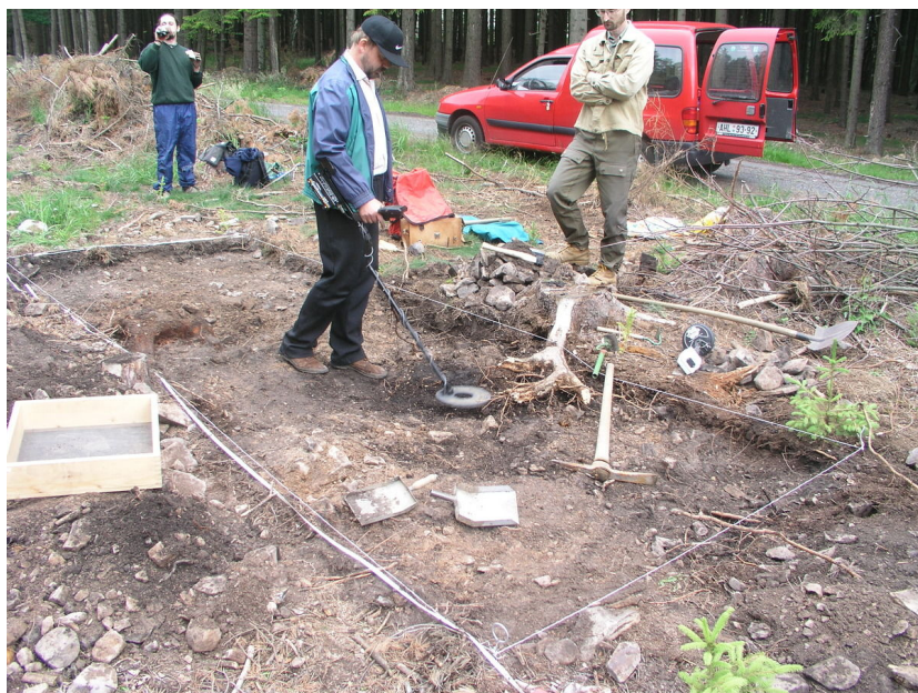
Rescue excavations near Stará Vrata.