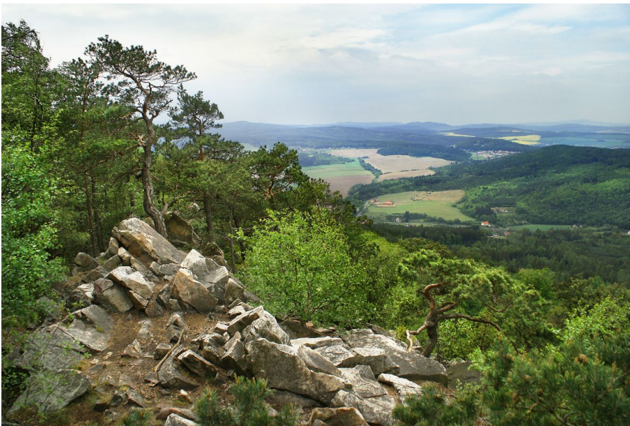
View of Litavka valley.