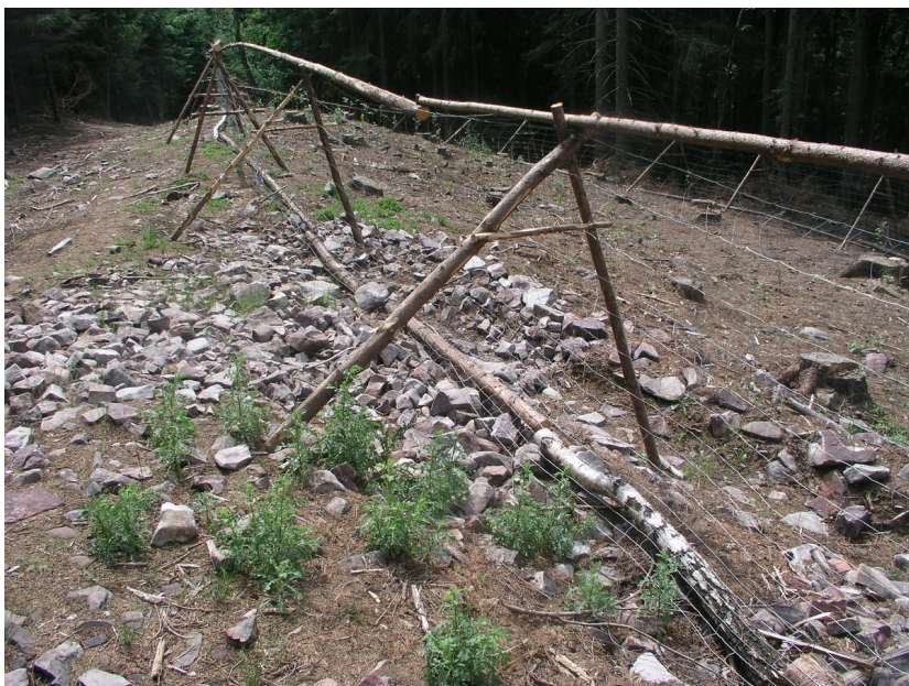
Stone bank damaged by forest works.