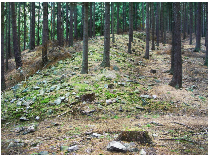
Stone bank of the hillfort.