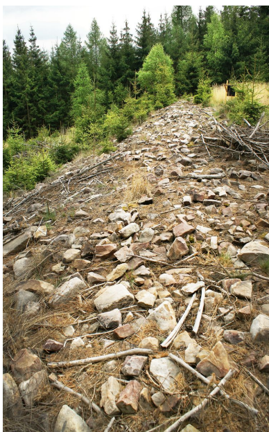
Stone bank on eastern side of the inner hillfort - acropolis.