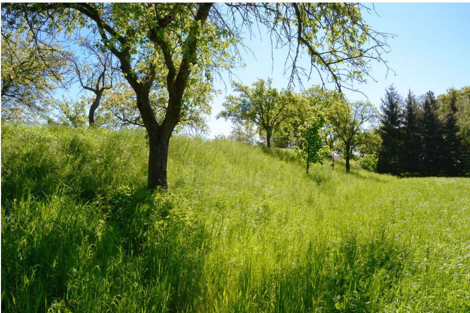
Inner bank in spring.