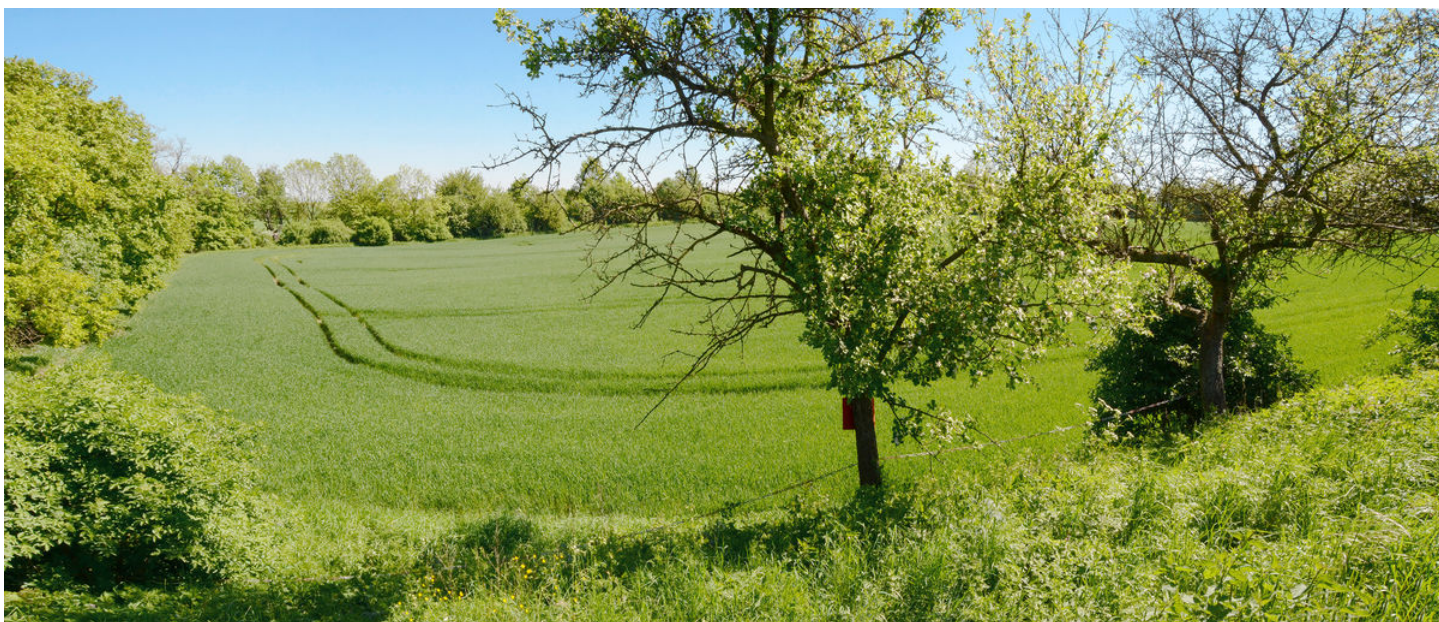
View on the bailey, outer bank in in the background.