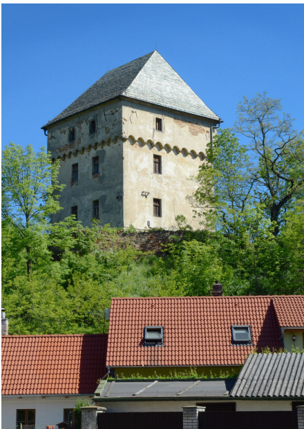
Late Medieval fortified manor in Pragou-Královice.