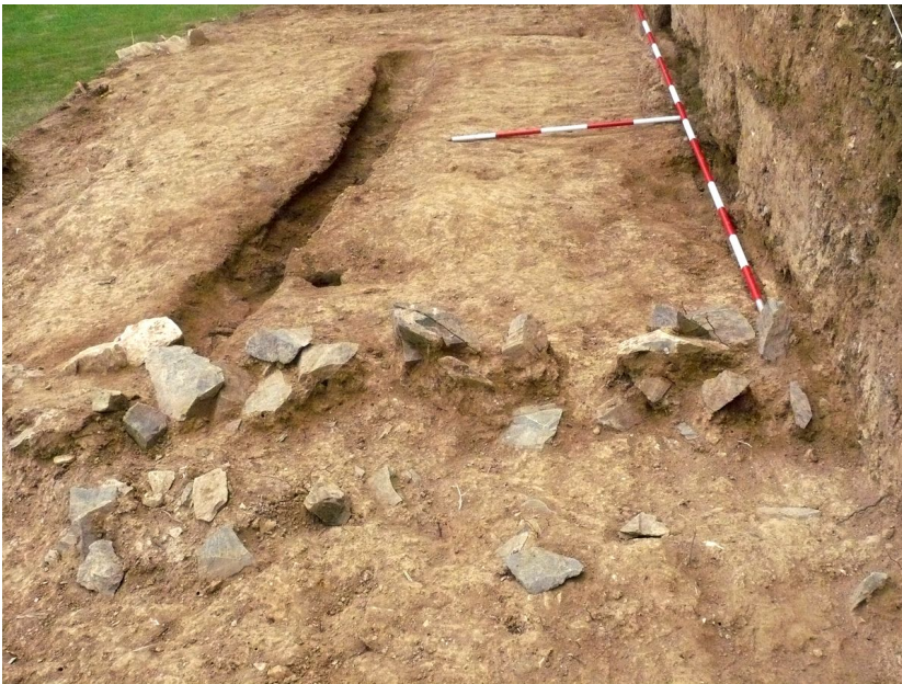
Remains of stone screen wall and inner wooden construction of the bank.