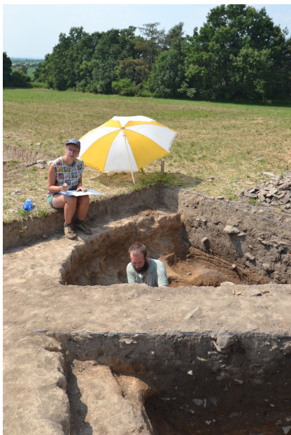
Documentation of a settlement feature at the acropolis during archaeological field work.