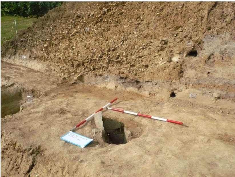
Huge post pole in the fortification rear.