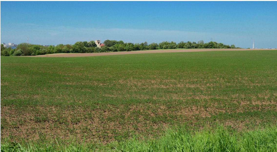
View from west on the outer fortification shows its extent.