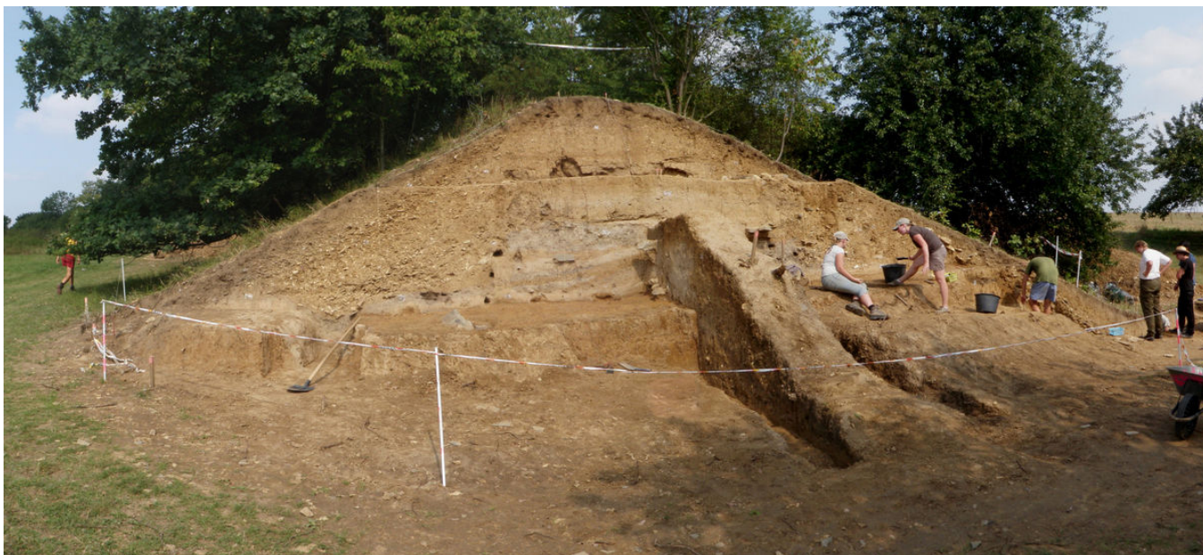
Excavations of the outer fortification, 2012.