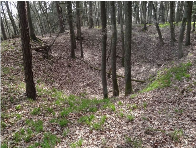
Pit mines connected by a channel.