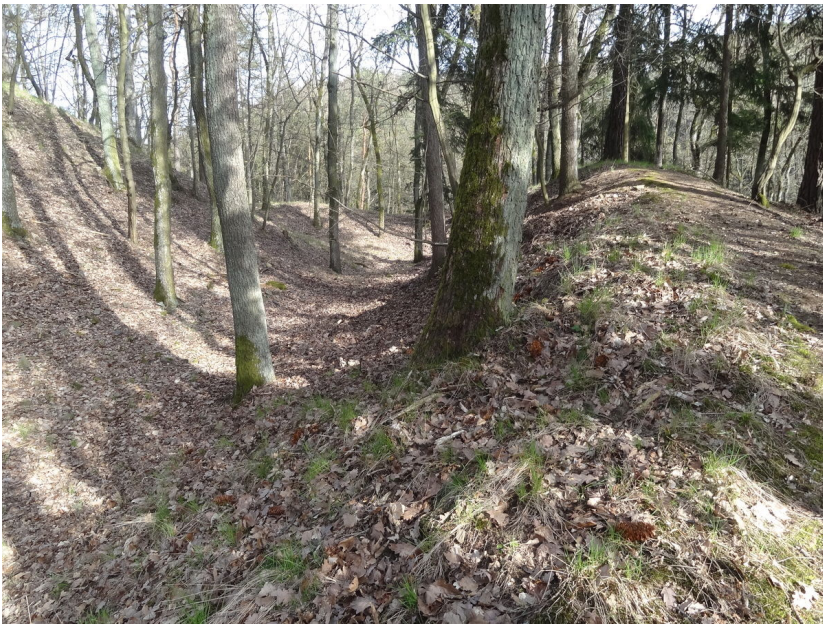
Outer fortification of the castle.