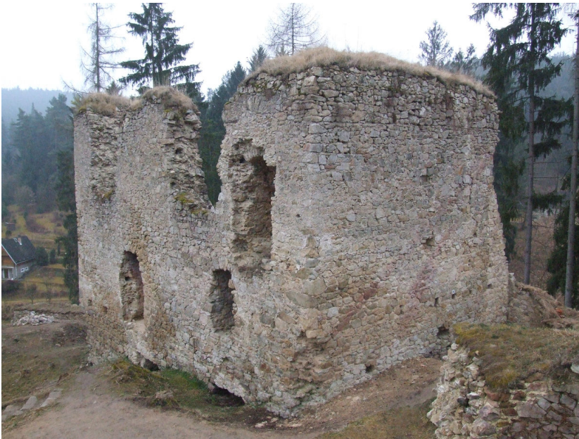
Probably the earliest palace of the castle core.