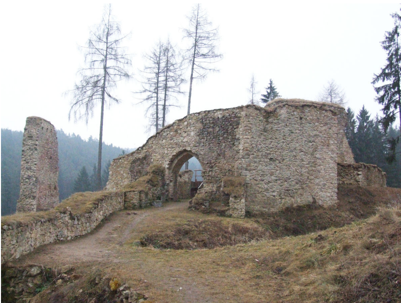
Castle core, taken from north. Photo J. Hložek, 2006.