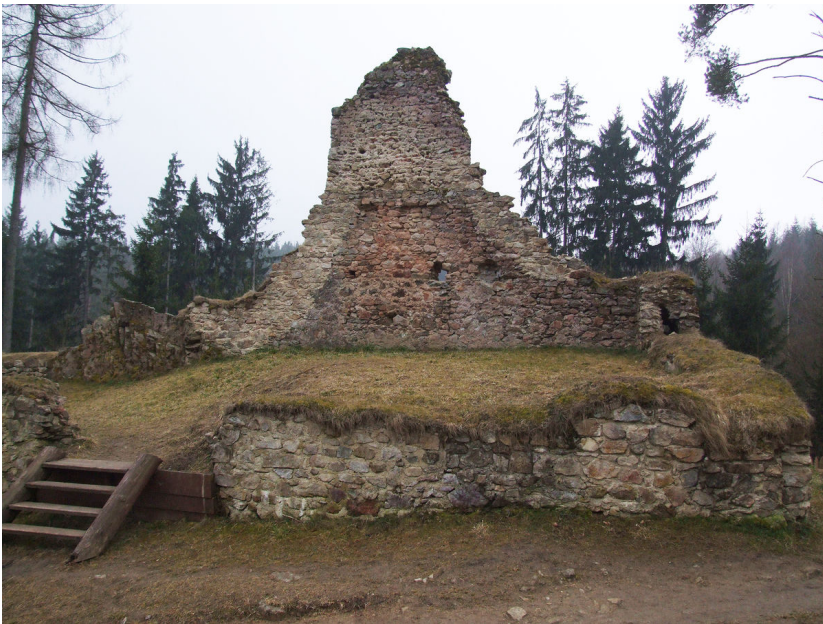
Otisk zateplené komory v prvním patře budovy na prvním předhradí. Foto J. Hložek, 2006.