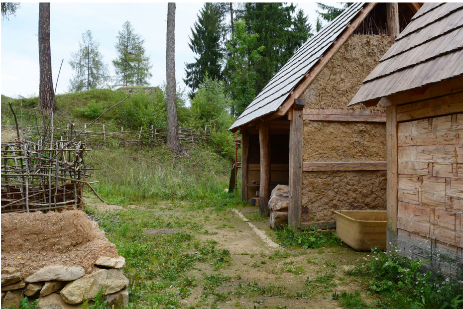
Reconstruction of buildings in museum in front of the castle.