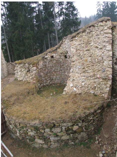
Remains of a bergfrit.