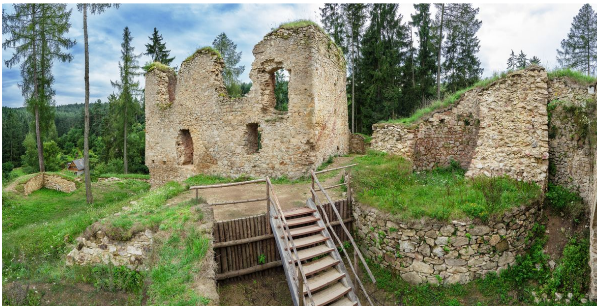
Castle core from north. Wall of the earliest castle palace, ruin of a bergfrit (right).