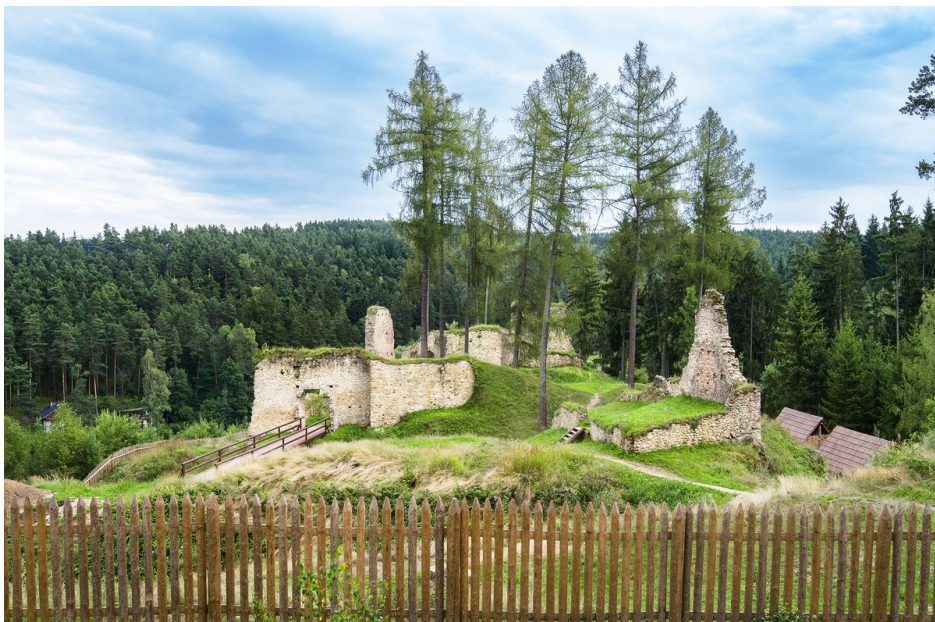
An overall view of the castle.