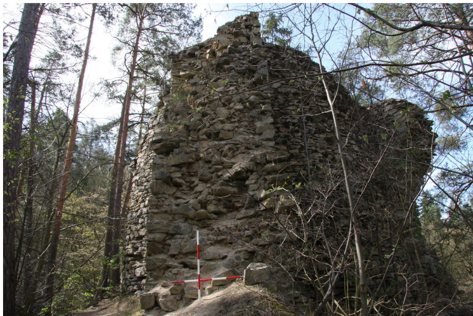
Fragment of the castle tower.