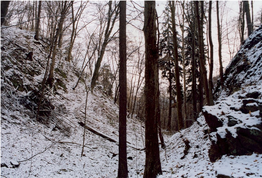
Neck ditch cut into the rocks.