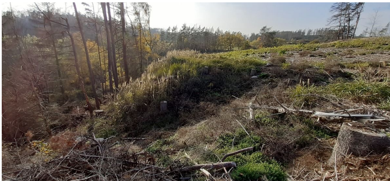
One of the siege positions in the surroundings of Rokštejn Castle.