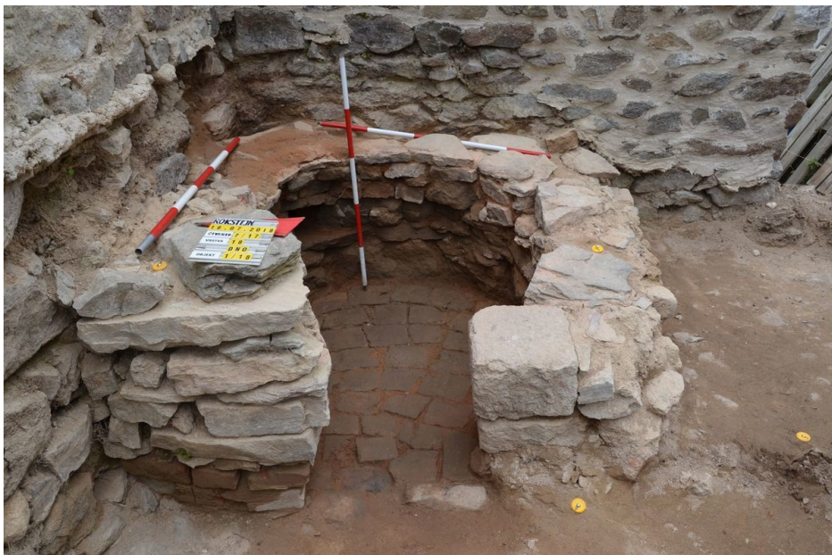
Remains of an oven at the gate of the lower ward.