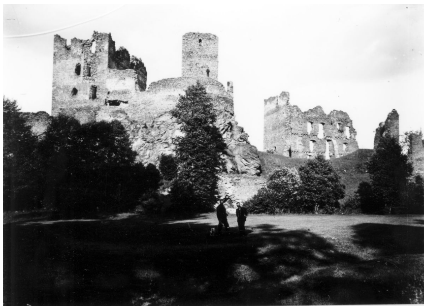
Rokštejn Castle around 1910.

Inv. No. 37 669.