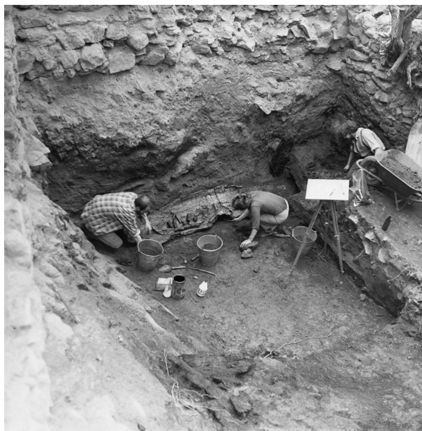
Wooden trough uncovered during an archaeological excavation in the 1980s.