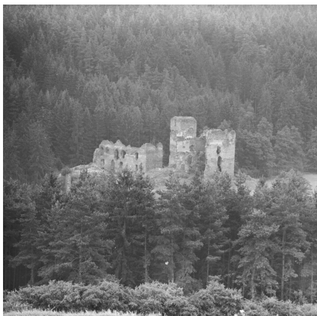
Aerial photo of Rokštejn Castle in 1981; from the north-east.