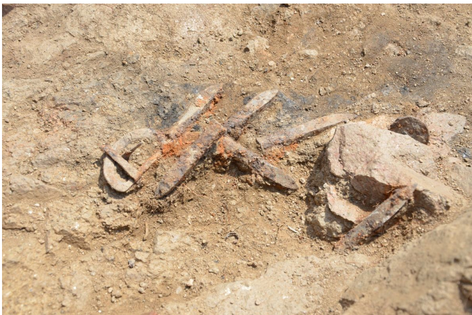
Remains of a quiver found during the 2017 archaeological excavation.