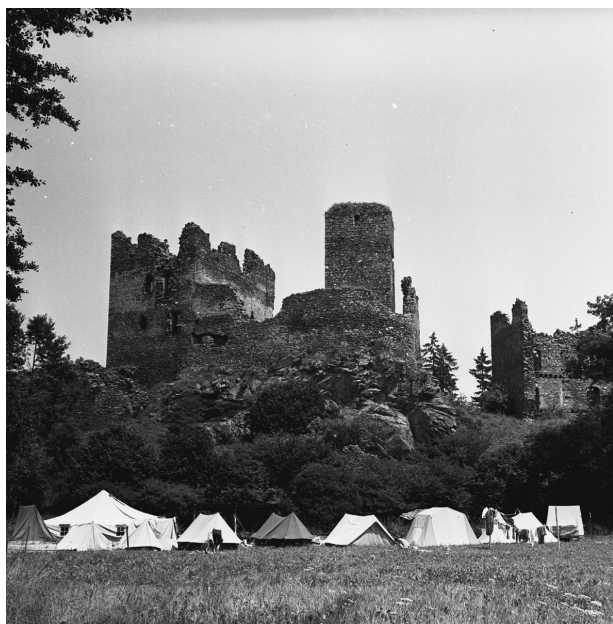
Archaeological camp at Rokštejn Castle in the 1980s.