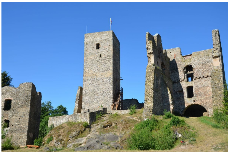
Rokštejn Castle, view of the polygonal tower and the palace.