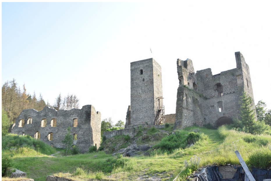
Rokštejn Castle; view of the lower palace and upper ward.

Museum of Vysočina Jihlava, photographic archive, Inv. No. 37 669.