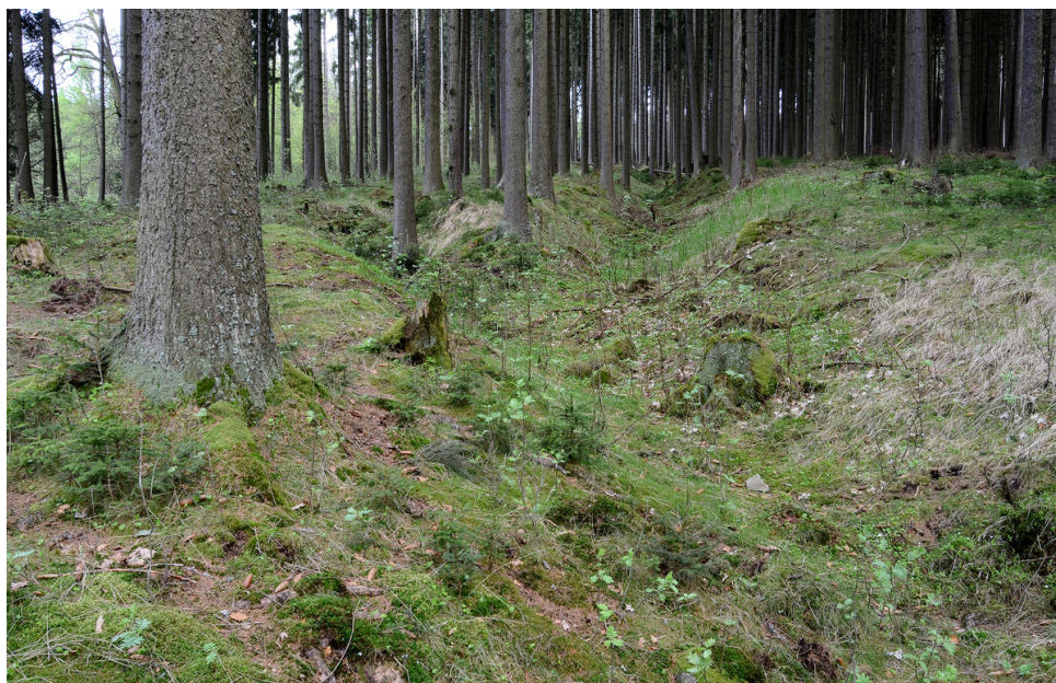
Hollow ways above the gamekeeper's lodge in Obora.