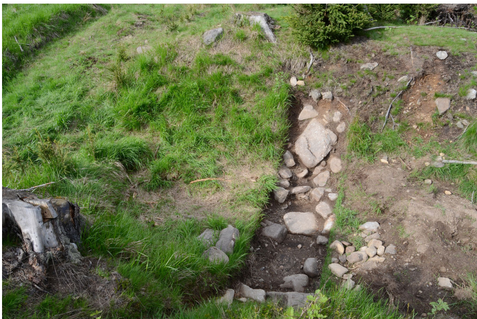
Cross-section of the hollow way.