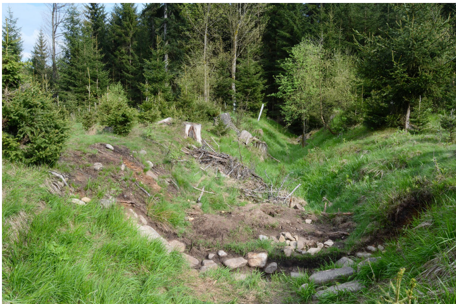
A hollow way between fords across Studenecký and Sklářský Streams.