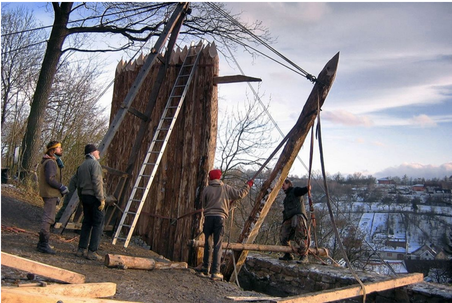
Snapshot from reconstruction of the Early Medieval fortification. Photo Z. Přebyl, 2005.