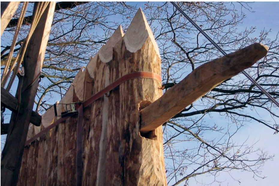
Palisade in the reconstructed rampart. Photo Z. Přebyl, 2005.