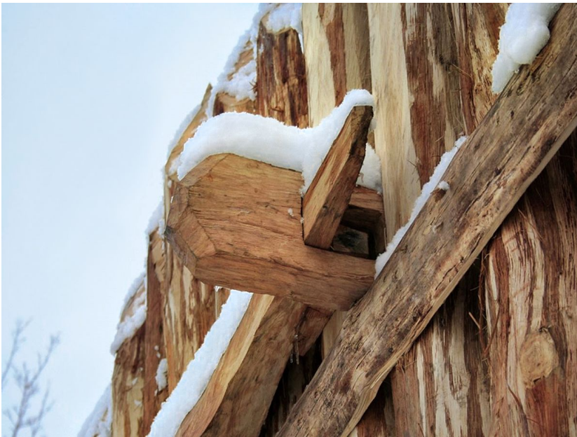
Palisade in the reconstructed Early Medieval rampart in the Netolice archaeological open-air museum. Photo Z. Přebyl, 2005.