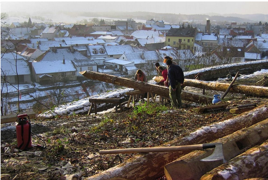
Building of the Early Medieval rampart reconstruction. Photo Z. Přebyl, 2005.