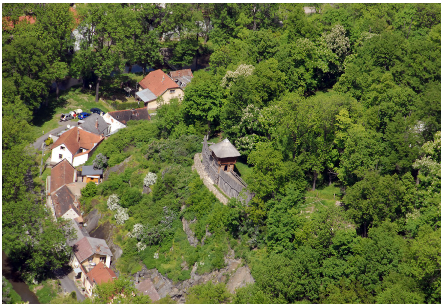
Aerial view of the hillfort.