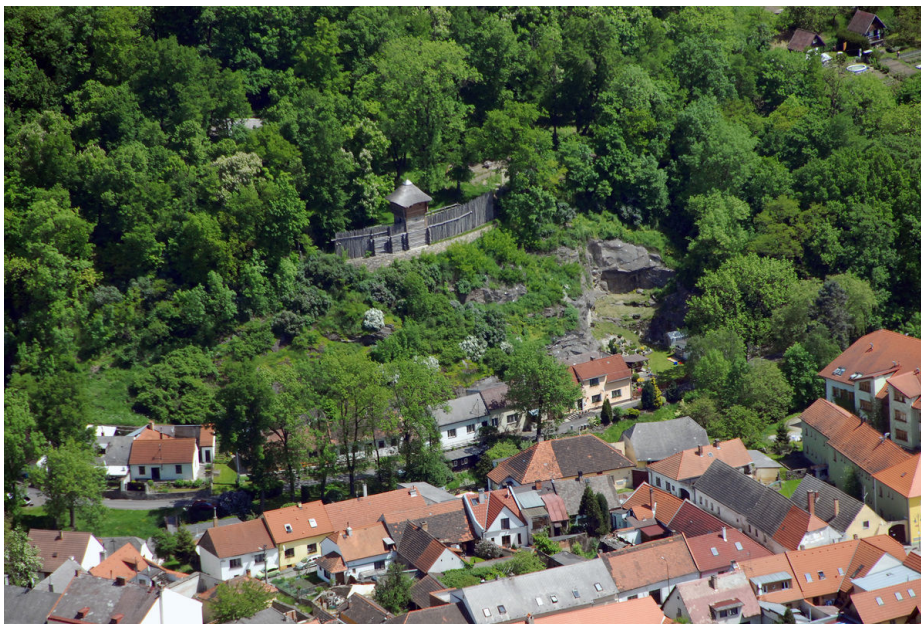
Aerial view of the hillfort.