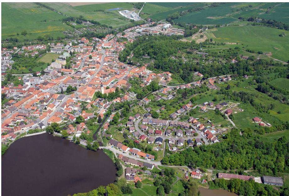
Aerial view of the city of Netolice with the hillfort.