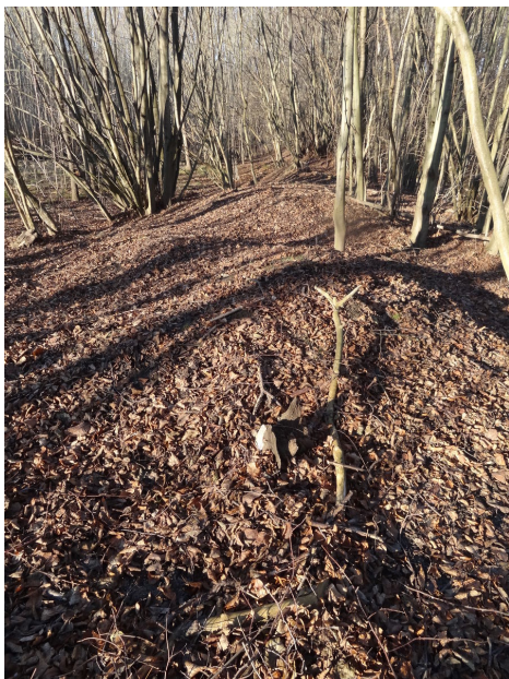
Outer earthwork of the hillfort.