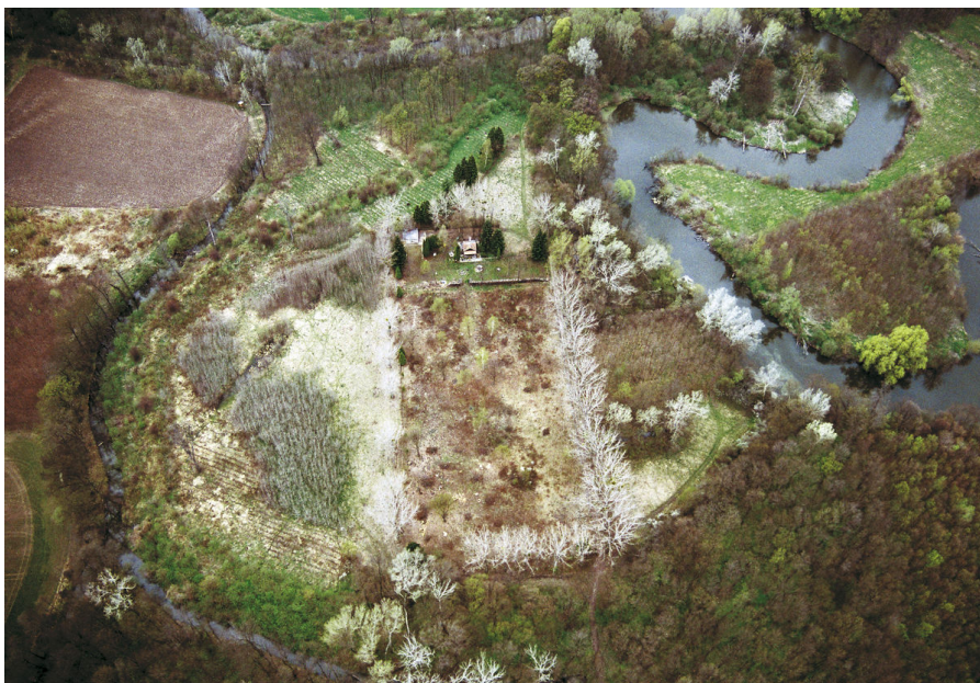
Aerial view of the upper ward of the hillfort and old meander.