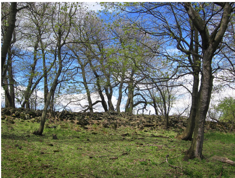
Stone banks of the hillfort.