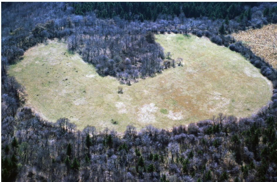
Aerial view of the hillfort.