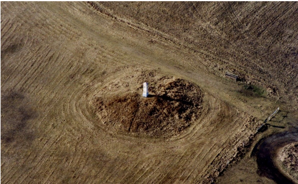
Aerial view of the Mohelno Serpentine Steppe with barrow and wayside shrine of St Anthony. Photo M. Bálek, 2000.