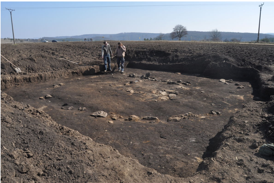
Stone construction of the barrow, inside with stone chamber divided by a wall for two cremation burials.