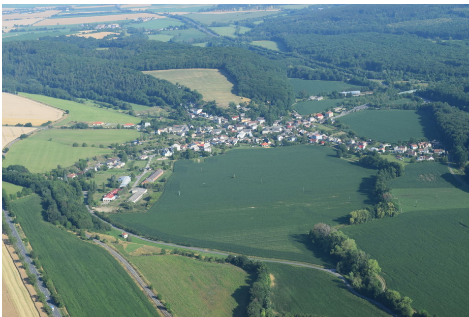
View of Mladeč from the south-east.