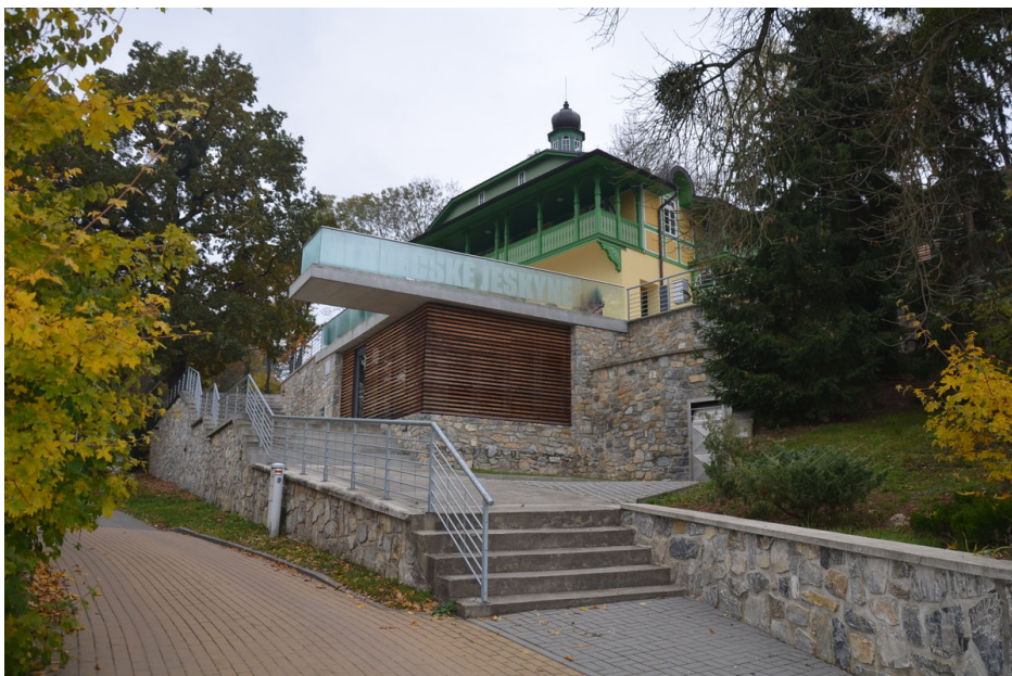
Mladeč, entrance hall.