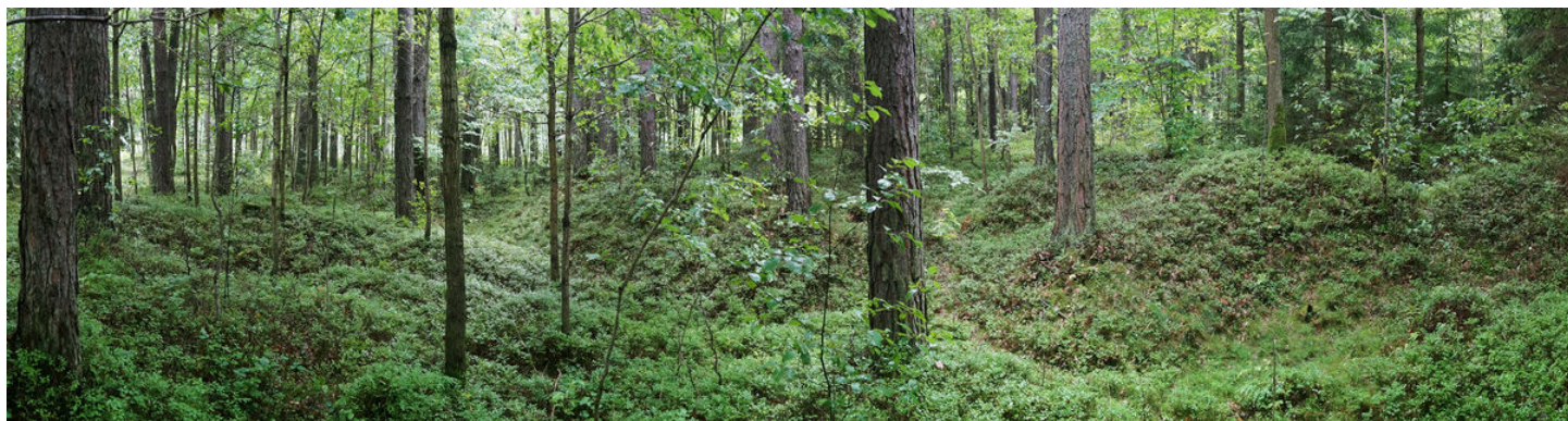
Panoramic picture of the mining area.