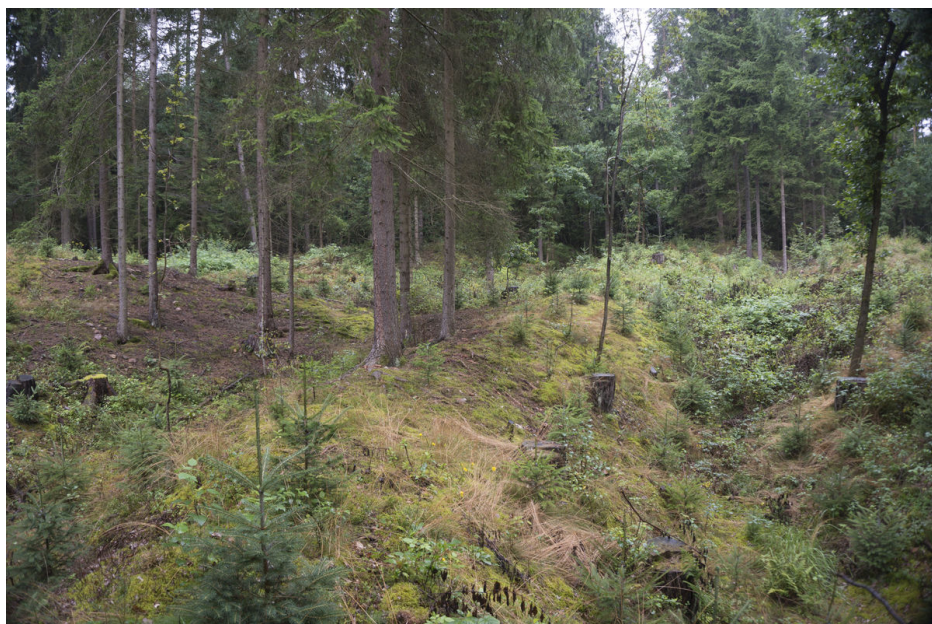
Remains of hollow ways or water channels.