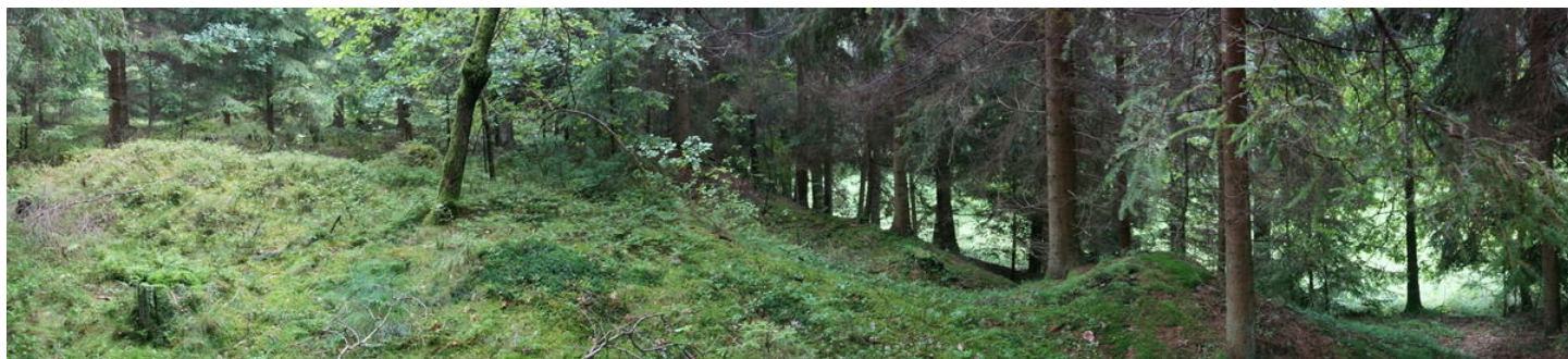
Eastern part of the area with remains of mining activities.