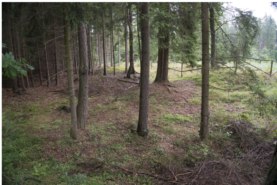
Western part of the area with remains of Early Medieval mining activities.