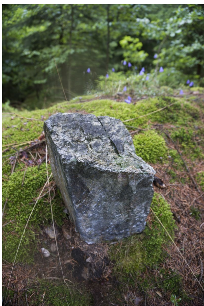
Boundary stone with an incised cross.