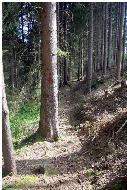
A line of boundary stones in eastern part of the area.