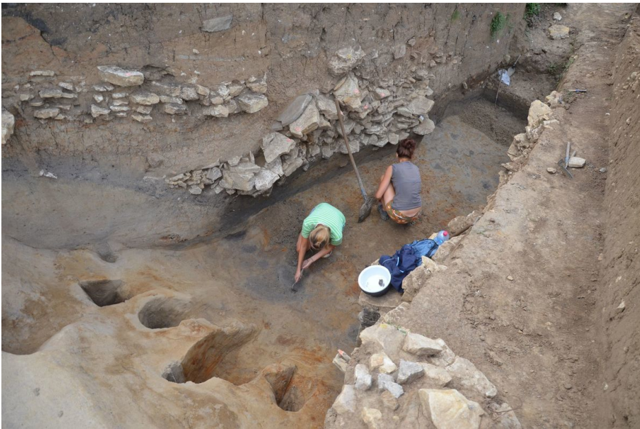
Section of the fortification by Church 2 at the acropolis in 2012.