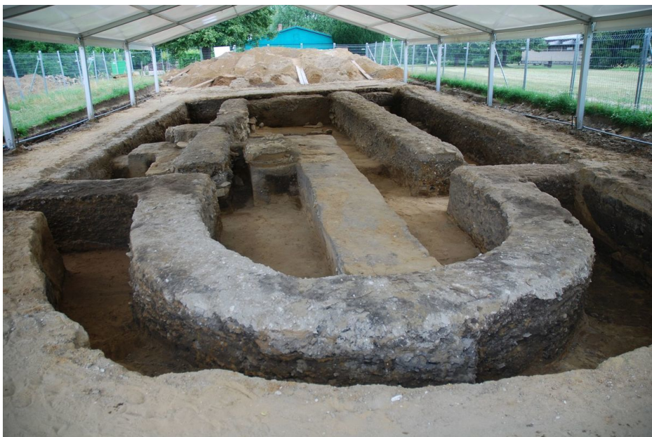
Revision excavation of the three-nave basilica (Church 3) in 2011.