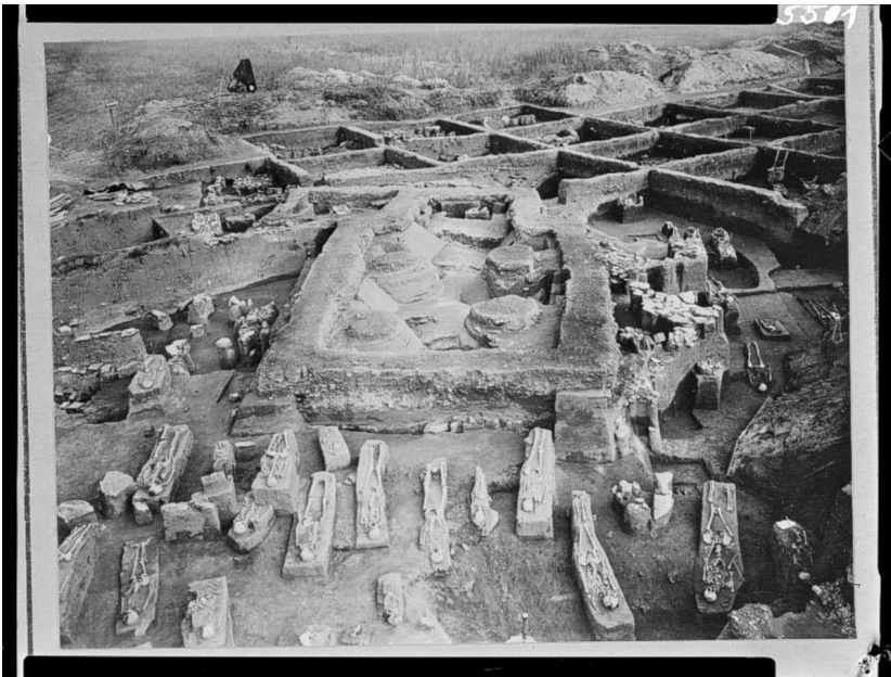
Ground plan of Church 2 and its cemetery; excavated in 1955. Photo J. Škvařil, 1955.