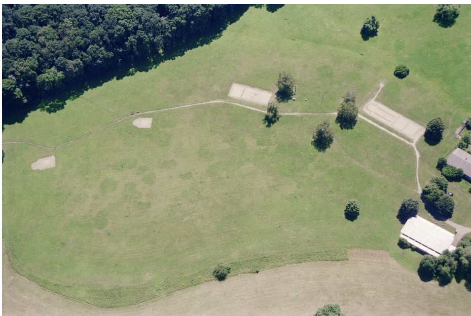
Aerial photo of the replicas of the foundations of the Mikulčice churches; from the north.