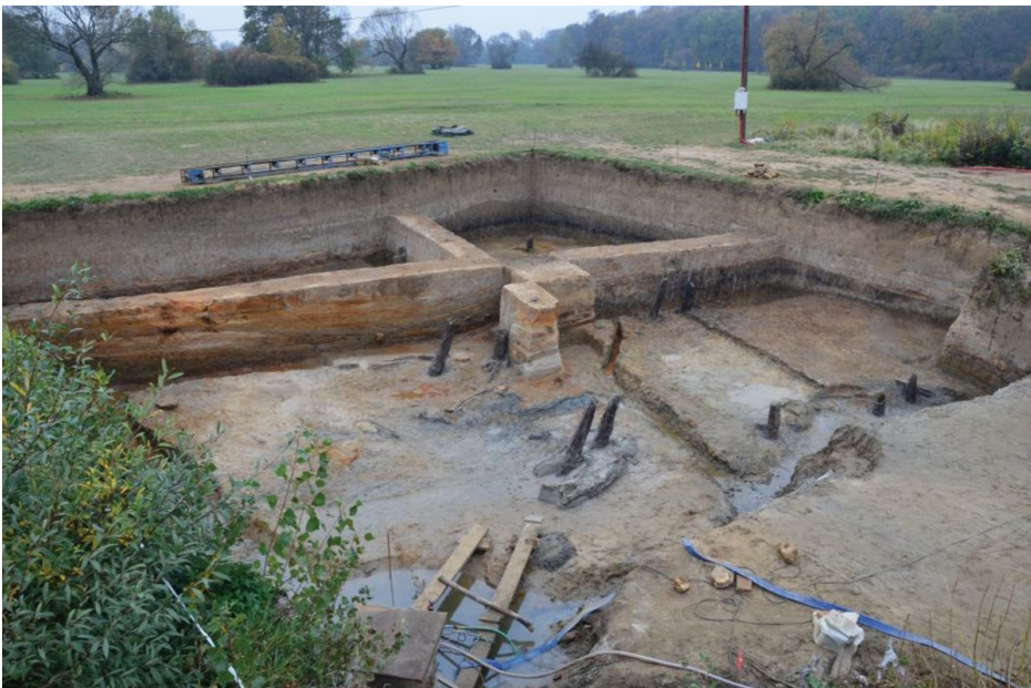
Supplementary excavation of the former riverbed with Bridge 1 in 2012.