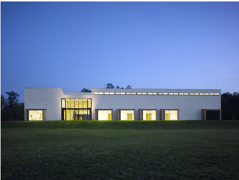
The research base of the Institute of Archaeology CAS, Brno, at Mikulčice. Photo AIB, 2013.