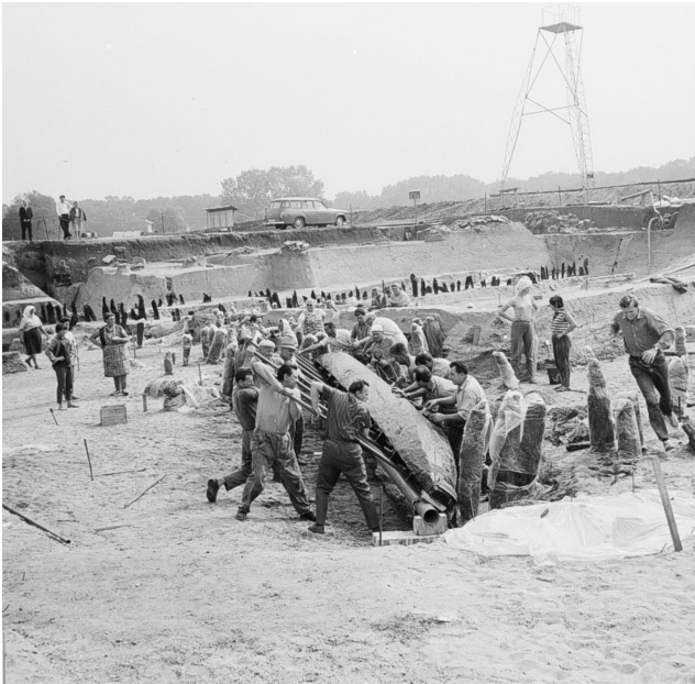
Lifting a Great Moravian monoxylon (dugout canoe) from the riverbed in 1967. Photo J. Škvařil, 1967.