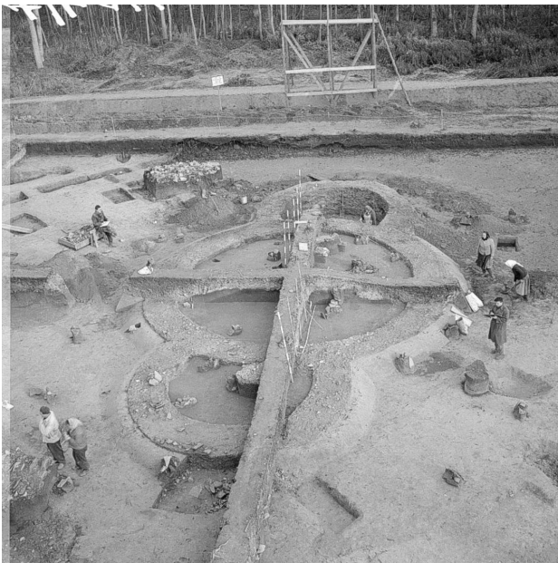
Excavation of Church 6 in Tešice Forest in 1960. Photo L. Krejčí, 1960.