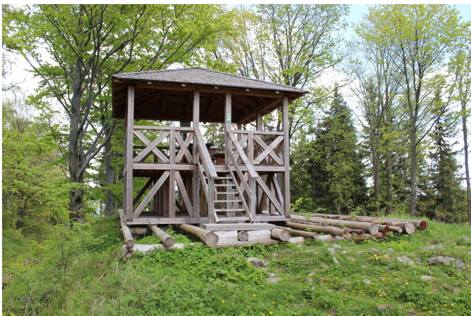
Lookout Tower at the place of the residential tower.