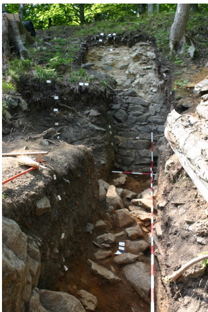
Remains of the castle wall during the archaeological excavation in 2012.