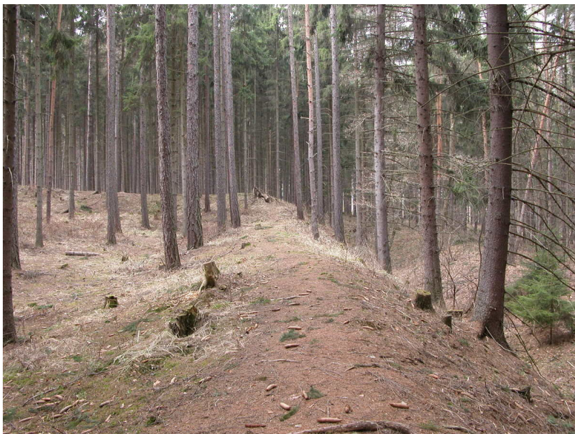
Earthwork and V-shaped ditch on the north part of the sponce; view from the east.