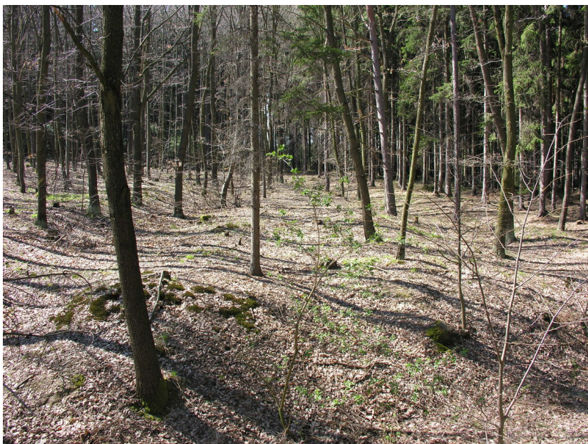
Remains of hollow ways in the south-eastern part of the inner area of the sconces, seen from the south-east.