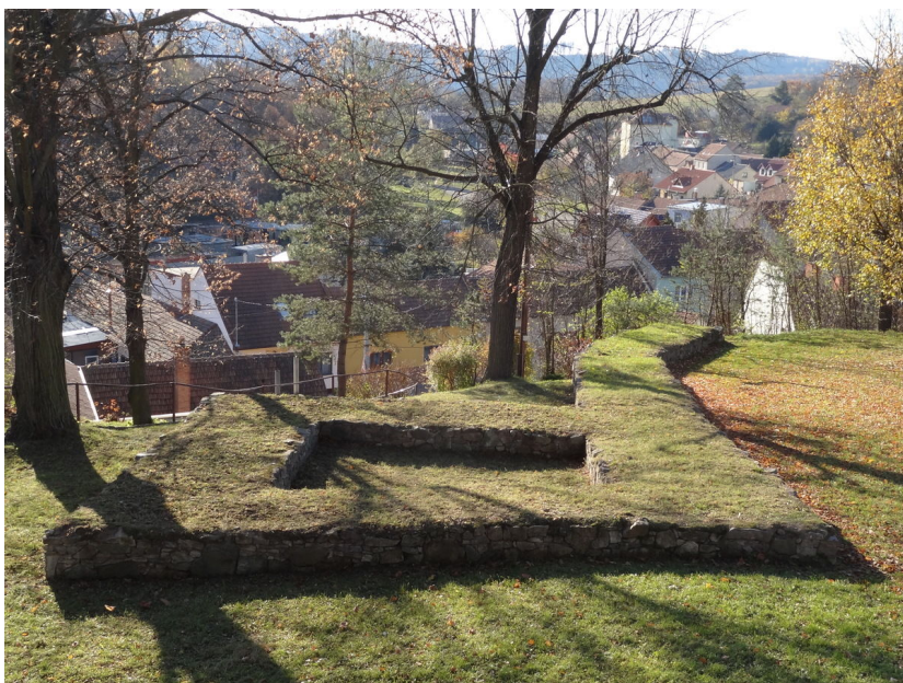
Presentation of the defence walls and a tower.