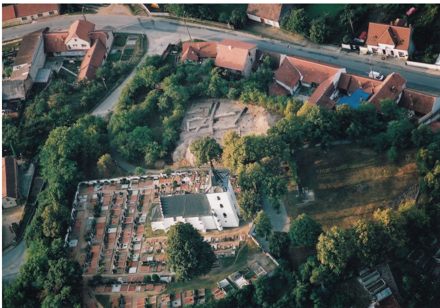
Aerial view of the spur with a church, remains of the castle and excavation in the foreground.