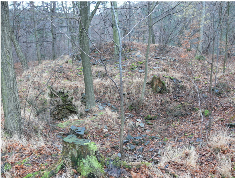
Remains of the buildings in the front castle.