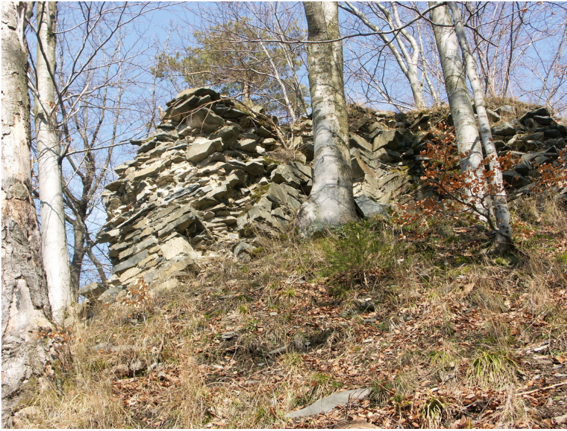
Front wall of the rear castle with the jambs of the gateway and a prismatic tower situated further up.