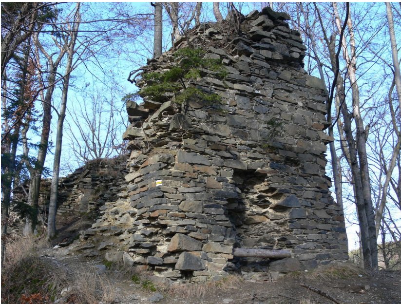
Rear castle: inner face of the west wall of the residential house with partially preserved window reveal.