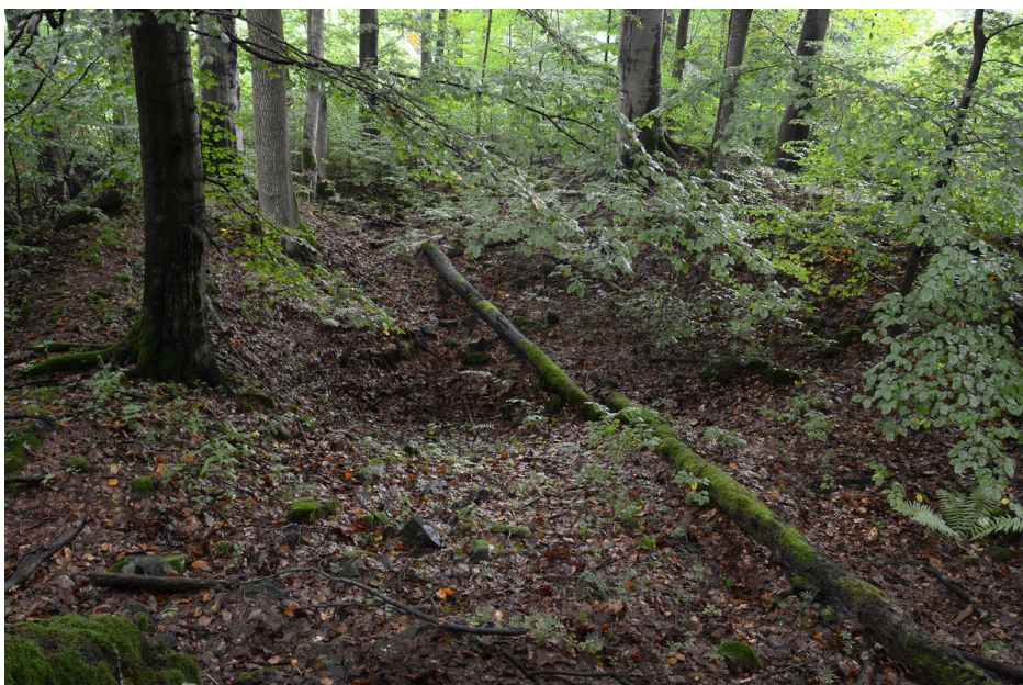
Church, taken from south.