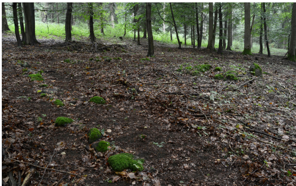
Remain of a log house with stone foundations.