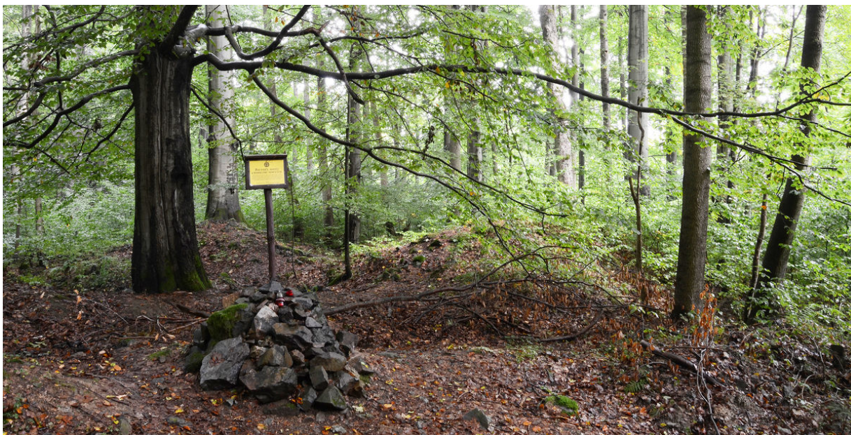
Information board, ruins of the church in the background.