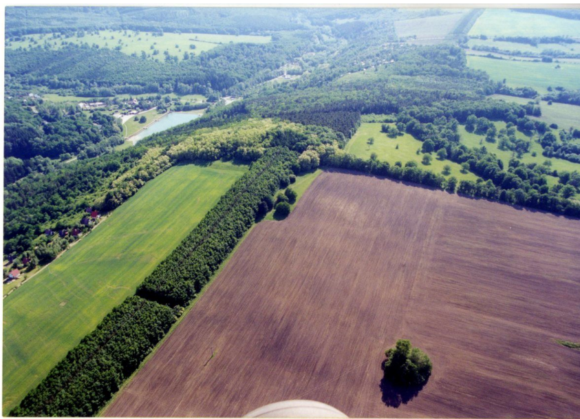
Aerial view of the hillfort.