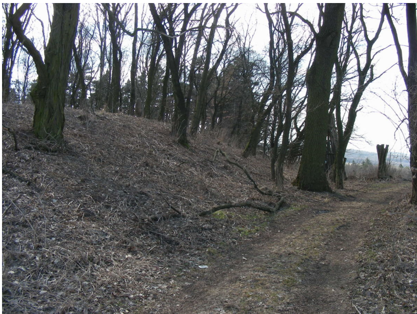
View of the earthwork of the hillfort.