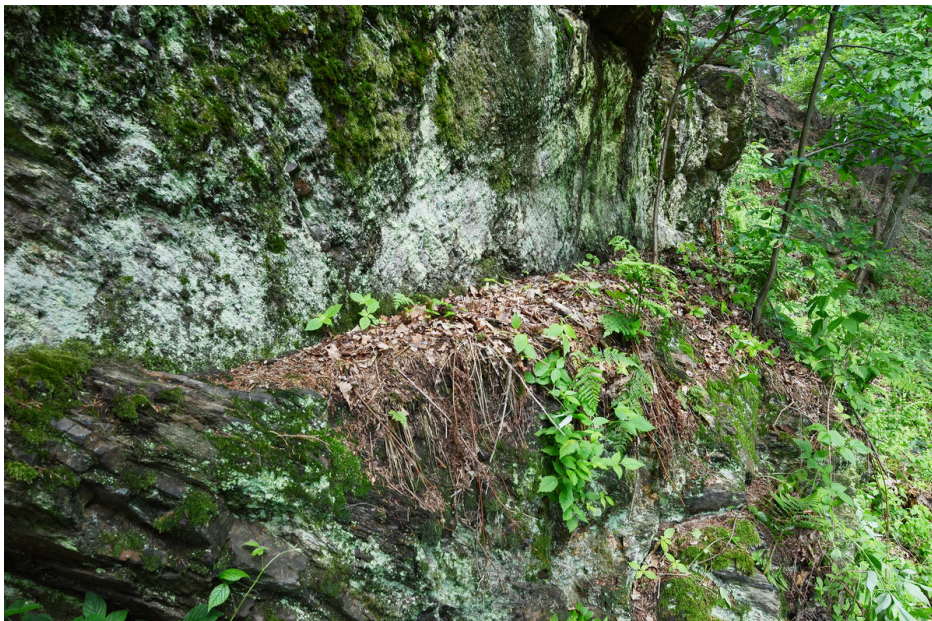
Part of a raceway.