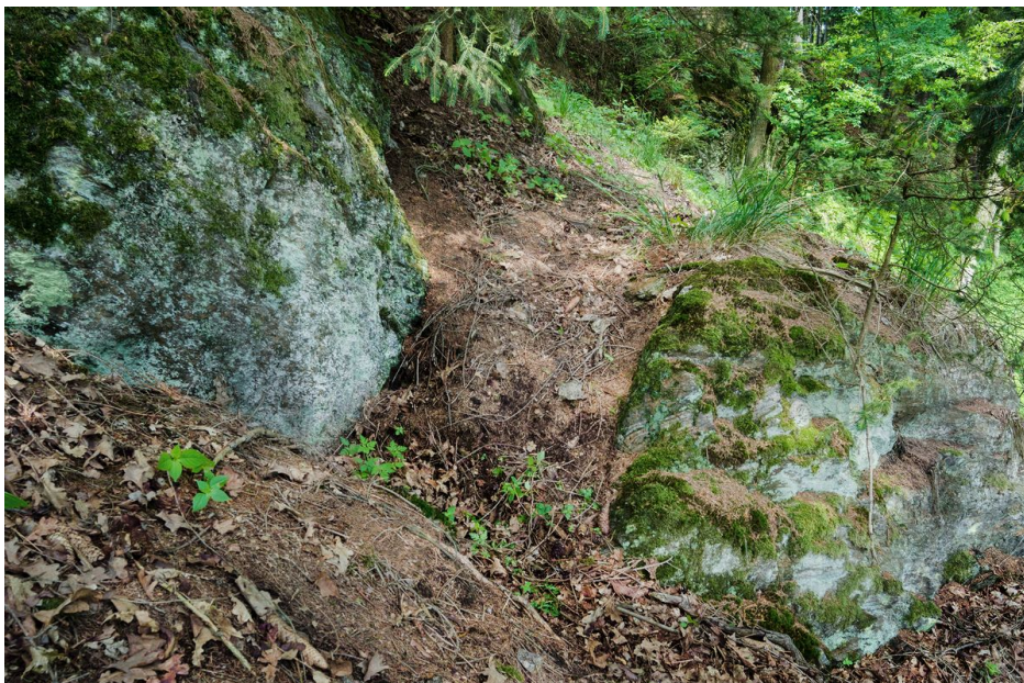
Profile of the former raceway.