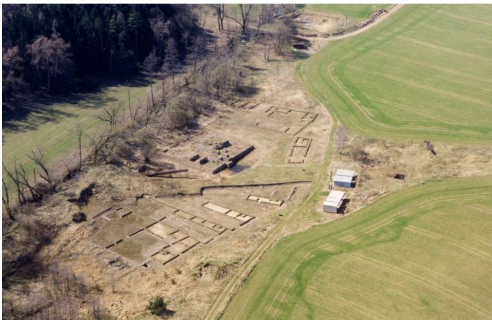
Aerial view of the deserted village with a presentation of the foundations of the houses and the remains of the manor house; water mill in the upper part of the image.