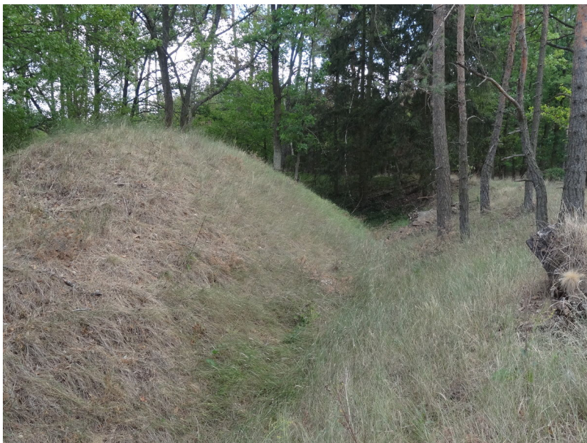
Temporary defence (3) and deserted village.