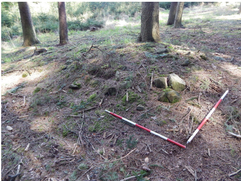
Debris of a building of the deserted medieval village.