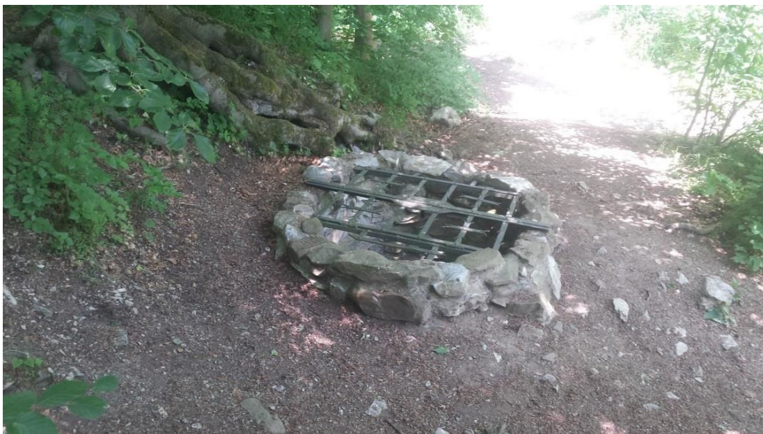
The exit of the alleged passage from Holštejn Castle to Hladomorna Cave.