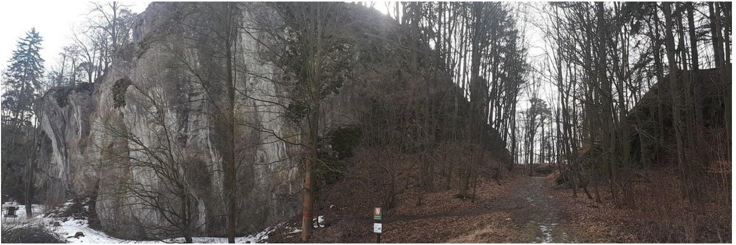
View of the rock spur from the north-west with a high rock wall, which exceeds 30 metres; on the right is the western ditch carved into the stone.