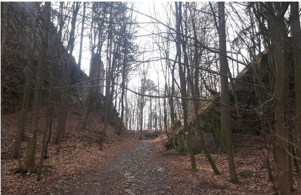
An artificially modified crevice below the west part of the castle core; on the left, there are the remains of the south-western castle corner, which is today the dominant feature (height of the ruin: 8.5 m).