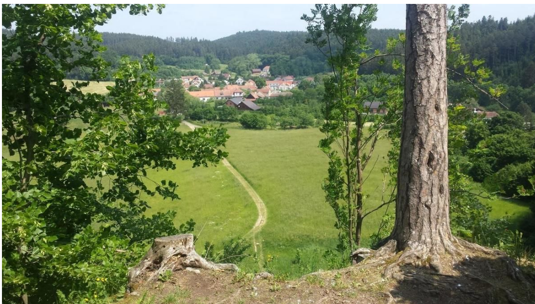
Overall view from the south of the deserted settlement (Na Městečku site) from the former residential building of the castle.