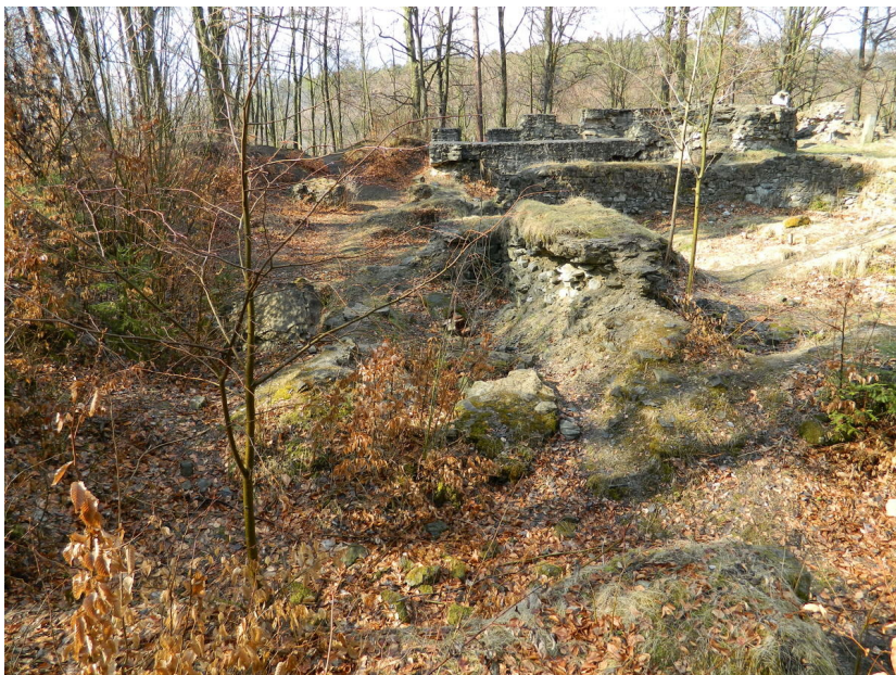
View of the small cloister and the abbey church from the south-west.