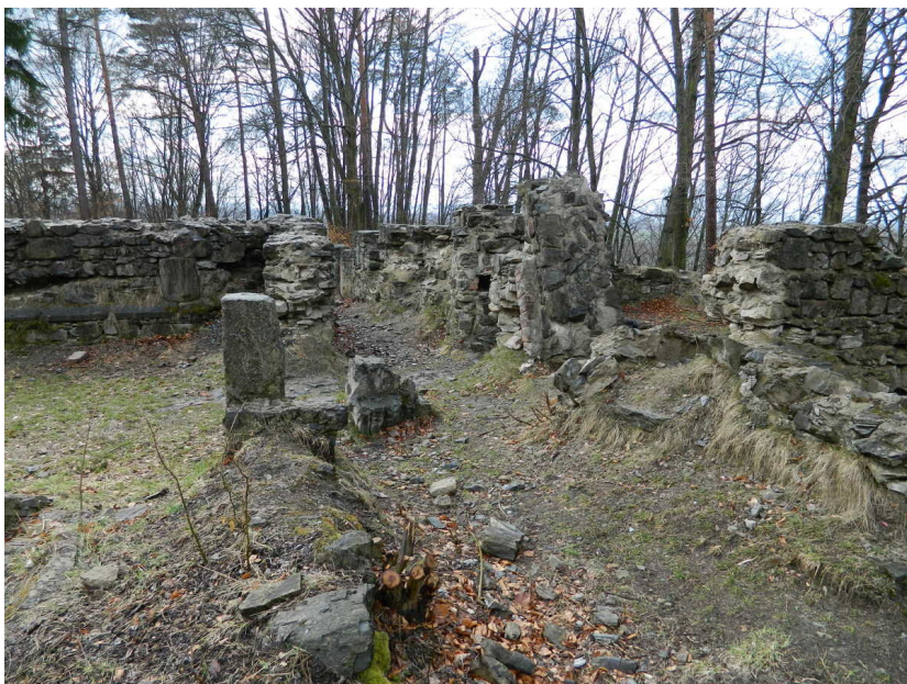
The large cloister from the east, monk's cells on the right. Photo H. Dehnerová, 2013.