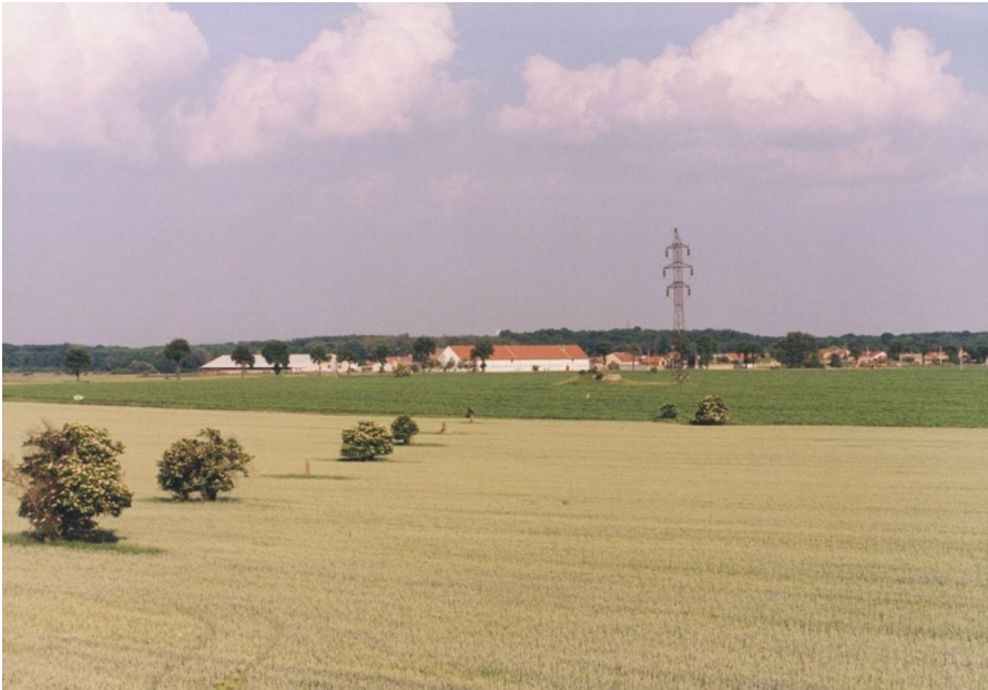
View of a temporary Roman camp from the north-west.