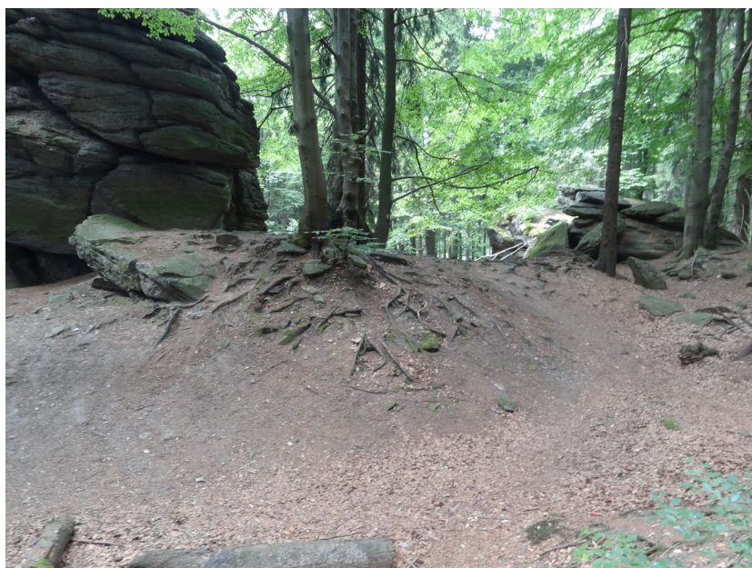
Short stone rampart between the rocks in the south part of the area.