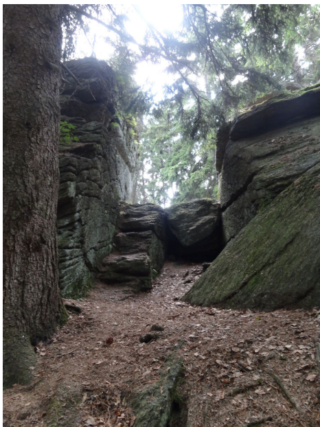
Short stone rampart between the rocks in the south part of the area.