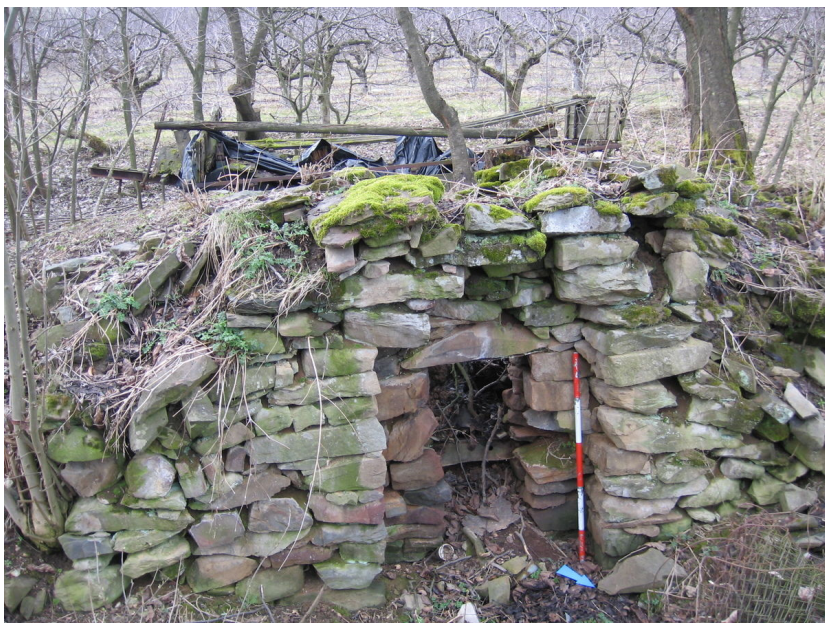
Navrátilova furnace in Blažov, village backyards of the farm No. 17, view from the north-east.