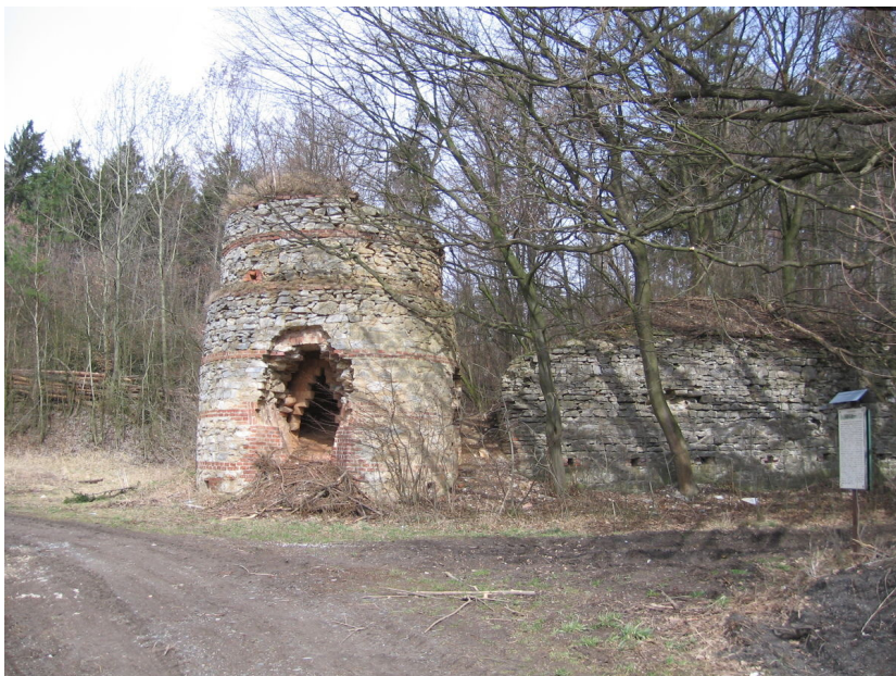
Limestone shaft mine from 1931 in Kovářov, Rachava field, current state, view from the south.