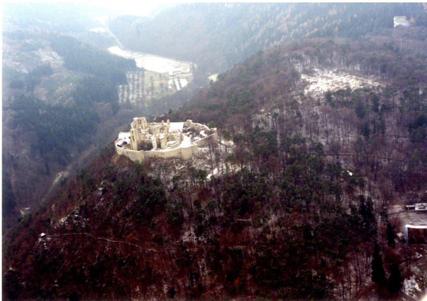
Aerial view of the castle from the south-east.