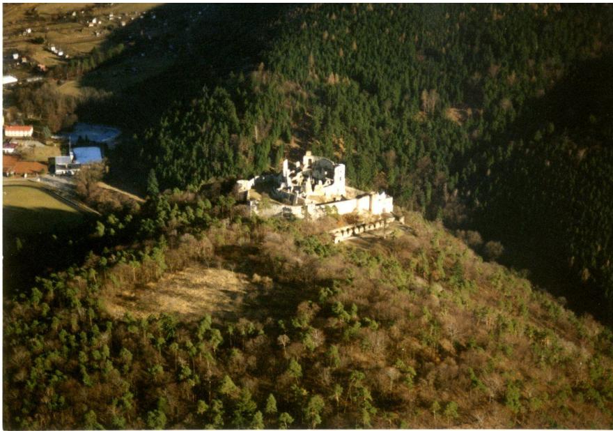
Aerial view of the castle from the west.