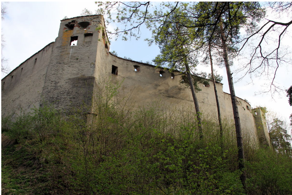
View of the mantlet wall.