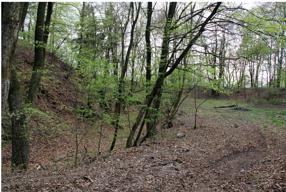
View of the bastion with parts of the ditch and earthwork.