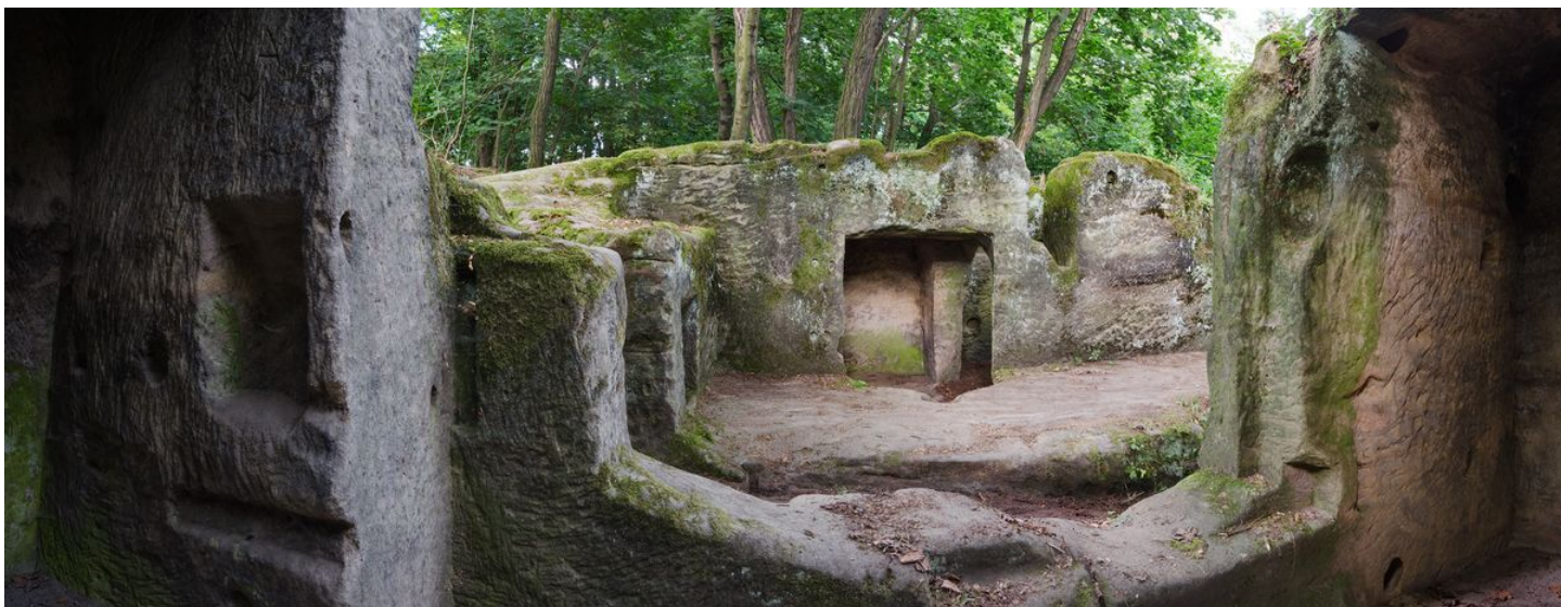
Rock village 'Valečovské světničky'.