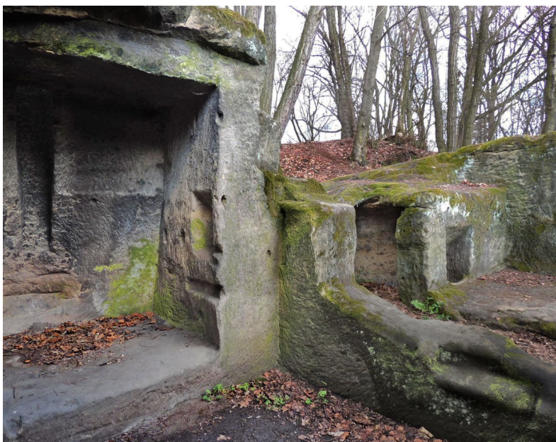
Homes in the rock village.