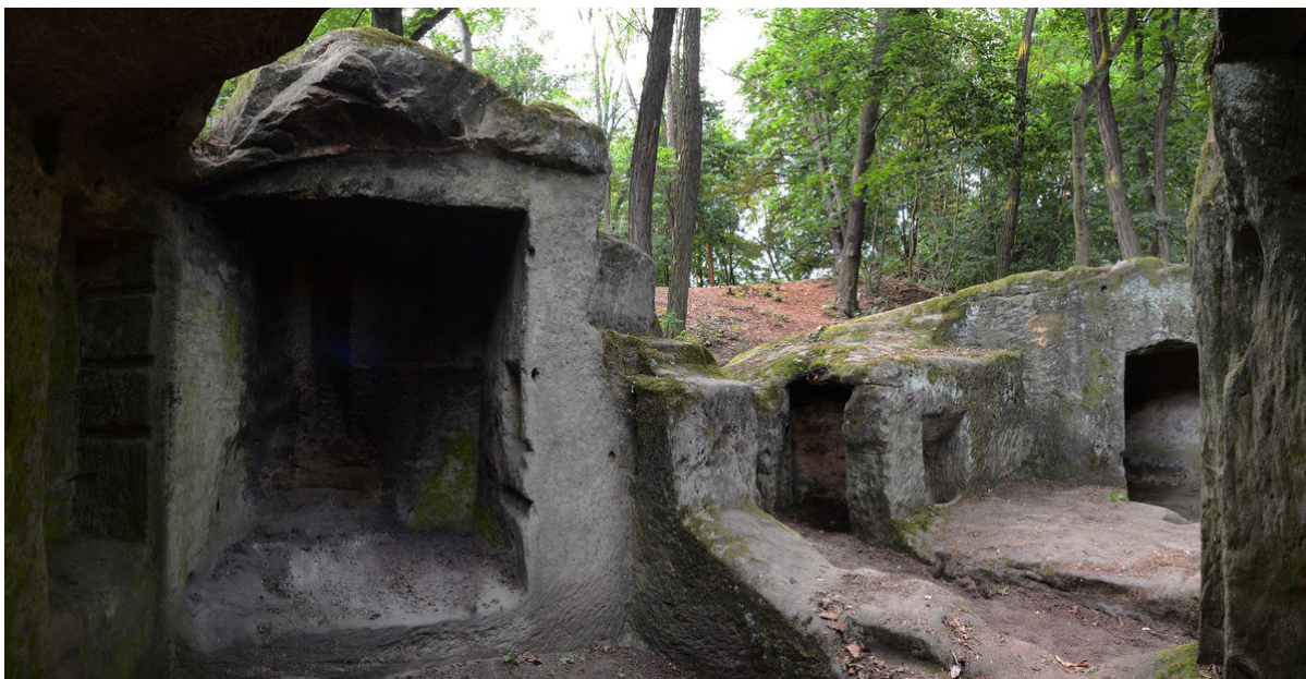
Homes in the rock village.