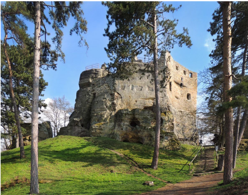
Valečov Castle, taken from south-east.