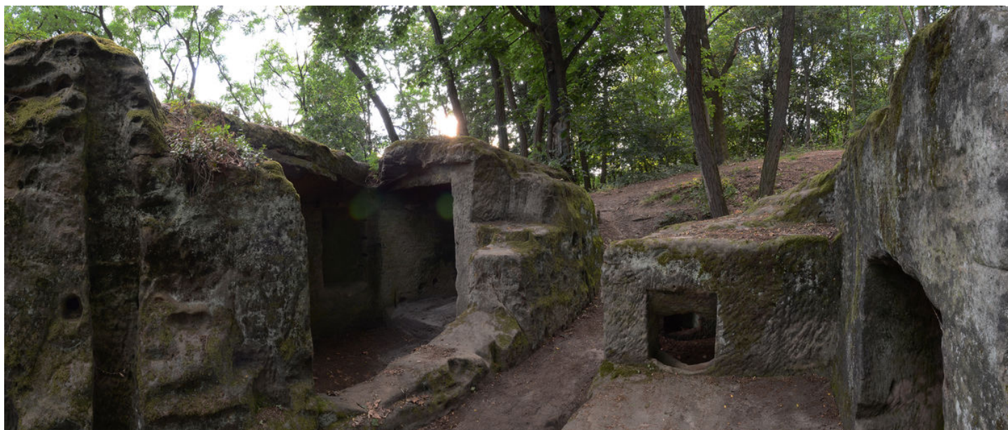
Rock village 'Valečovské světničky'.