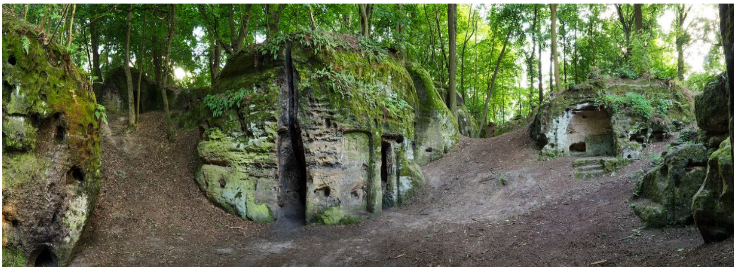
Rock village 'Valečovské světničky'.