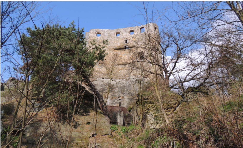
Valečov Castle, taken from south.