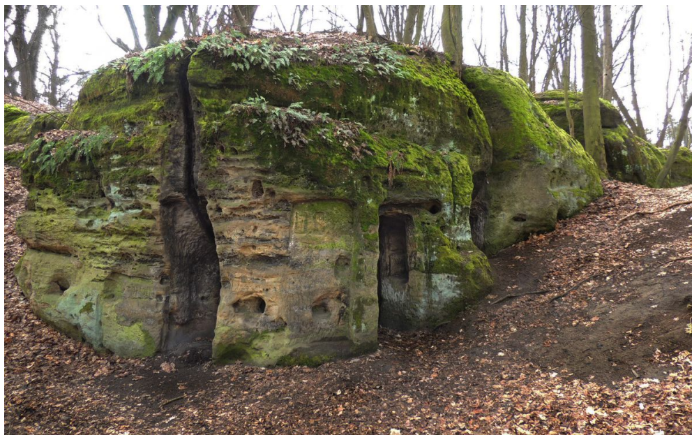
Homes in the rock village.